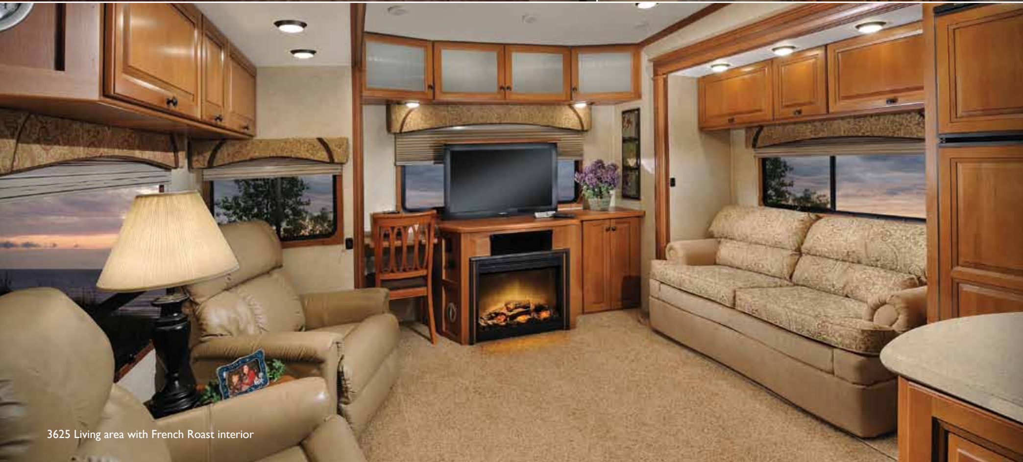
3625 Living area with French Roast interior