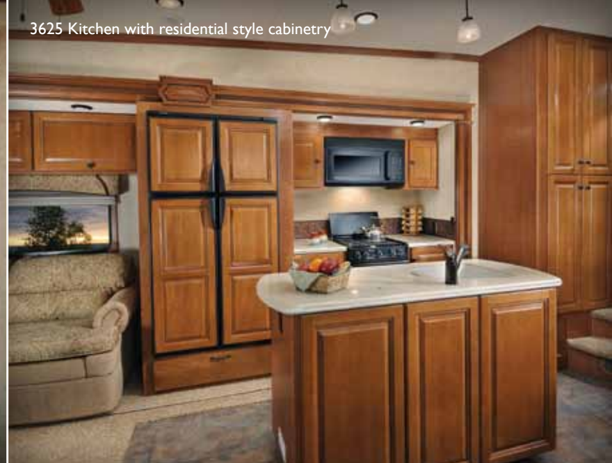
3625 Kitchen with residential style cabinetry