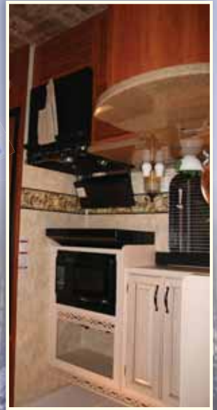
Kitchen with 2-tone cabinets