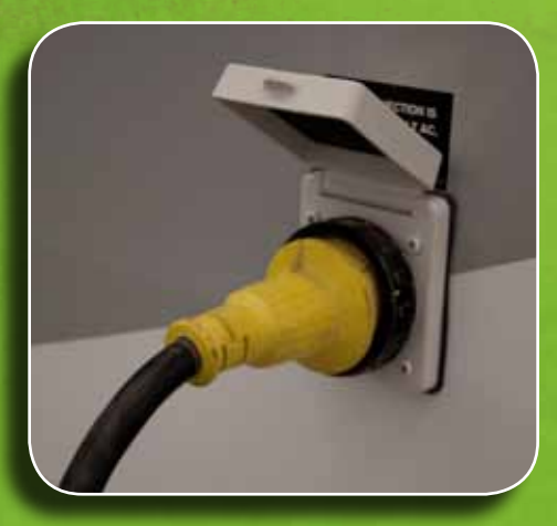
Removable Shore Cable