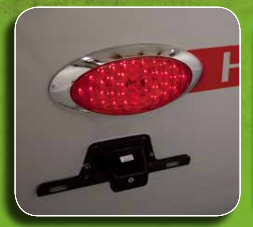
LED Tail Lights

Towable by many of today's popular crossover vehicles and smaller SUVs.