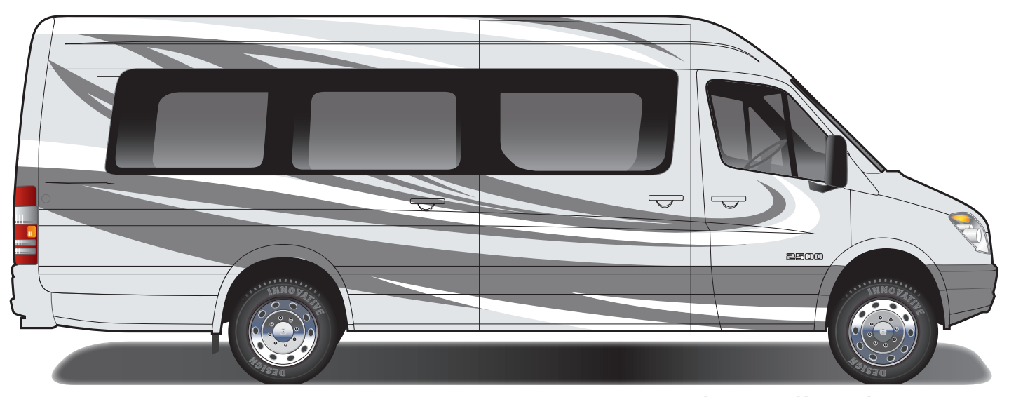
Diamante Silver Full Body Paint