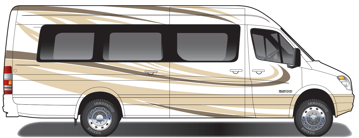
Iced Mocha Full Body Paint