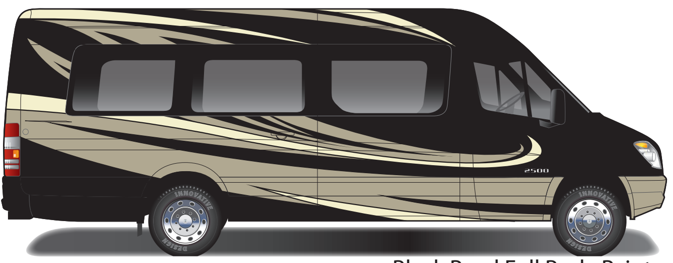
Black Pearl Full Body Paint