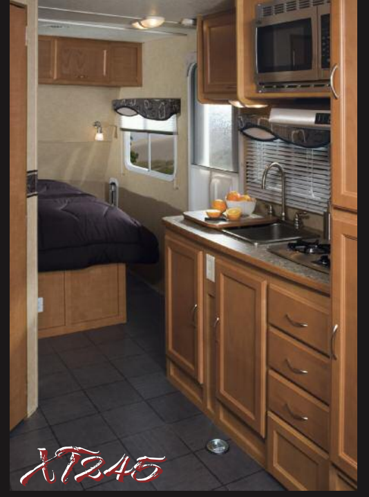
Queen size walk around bed and plenty of kitchen storage.