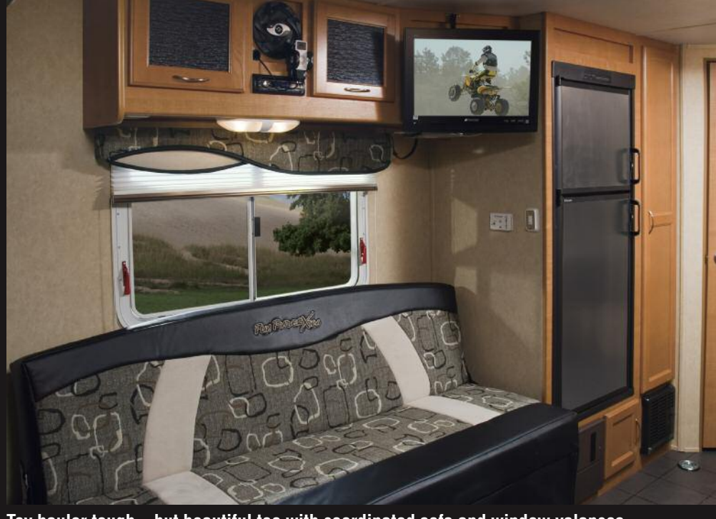
Toy hauler tough – but beautiful too with coordinated sofa and window valances. The overhead entertainment options are within easy reach and include stereo with i-Pod cradle, speakers, amplifier and an optional flatscreen TV.