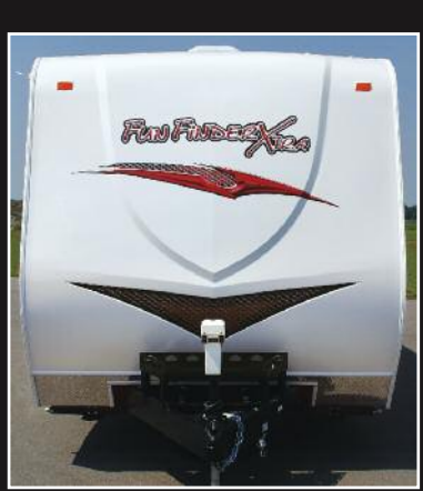
Front fiberglass cap with graphics, removable front storage tray and diamond plate rockguard.