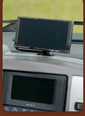
GPS Stay on course with turn-by-turn voice guidance from the available Garmin® GPS. A large touch screen and a remote control make this an invaluable navigation tool in unfamiliar areas.