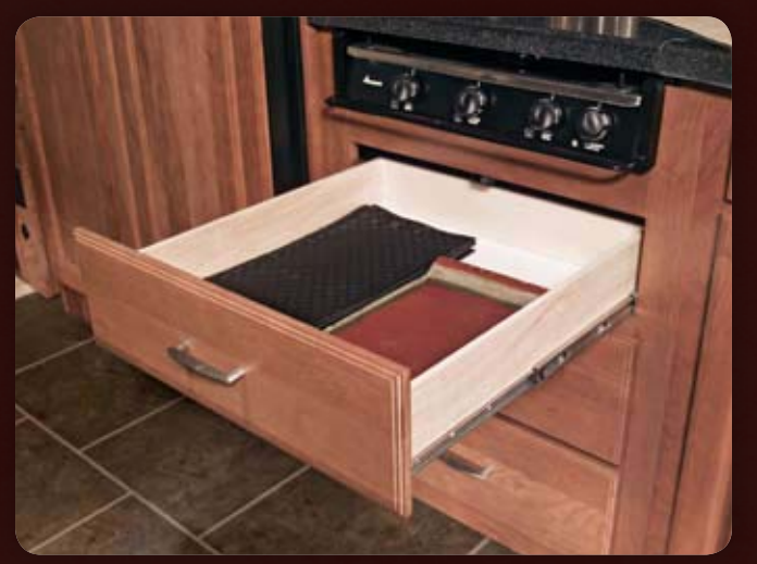
Drawers Sized for maximum storage, the kitchen drawers hold tight with positive latches and open on full-extension slides for easy access.

Bountiful food storage can be found in the pullout pantry (NA 40L) with adjustable shelving and a large four-door refrigerator/ freezer. Dine in style at the BenchMark<sup>®</sup> dinette, the available dining table/buffet (34Y, 40L and 40T), or the free-standing dining table and chairs (39N, 40L and 40T).