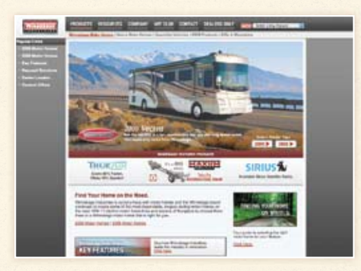
GoWinnebago.com Watch key feature videos, take interactive tours, see the latest promotional offers and a whole lot more at GoWinnebago.com.

You'll also have plenty of options for stretching out, including the Rest Easy<sup>®</sup> sofa or the available Rest Easy theater seating with twin recliners that convert into beds (Journey only).