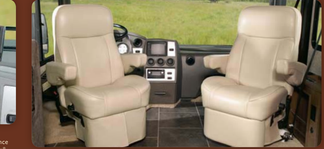
Cab Seats The six-way power adjustment capability of the Journey's driver seat is available for the Journey Express and for the Journey's passenger seat. A footrest lets the passenger stretch out and relax. Both seats come in soft UltraLeather<sup>™</sup> with adjustable lumbar support and rotate to add flexibility to the living space.