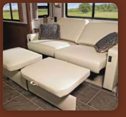
Rest Easy The Rest Easy multi-position lounge glides from sofa to recliner to bed at the press of a button.