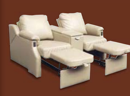
Theater Seating Available Rest Easy theater seating in the Journey features matching recliners with a handy center console. The recliners easily convert into twin beds.

Living Room Enjoy all the comforts of home in the Journey's large living area. Both the front and bedroom TVs come pre-wired for the available King-Dome® satellite system with dual LNBs that can receive satellite channels for two separate receivers.* * Receivers not included. Not available in Canada.