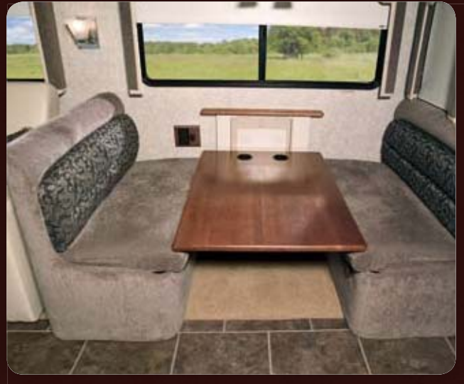
BenchMark <sup>*</sup> The BenchMark full-comfort dinette converts into a bed, conceals additional storage under the seats and features the Dream Dinette<sup>™</sup> table that allows you to adjust the table height quickly and easily.