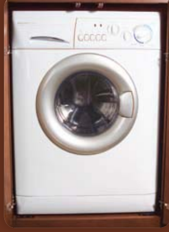
Washer/Dryer Add the washer/dryer and enjoy the convenience of fresh laundry without the laundromat.