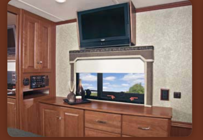
TV/Stereo The 26" LCD HDTV is positioned for optimal viewing and the available stereo system with a CD/DVD player lets you drift off to sleep with your favorite music.