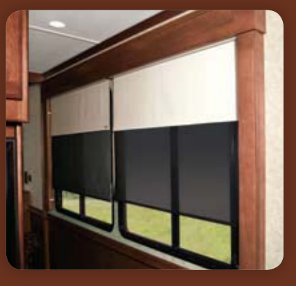
Roller Shades The available duo roller shades (Journey only) look sharp and incorporate both a sun shade and a privacy shade.