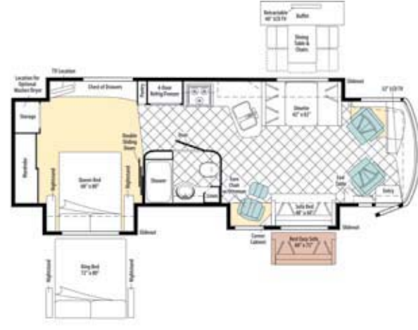
Journey Express 34Y