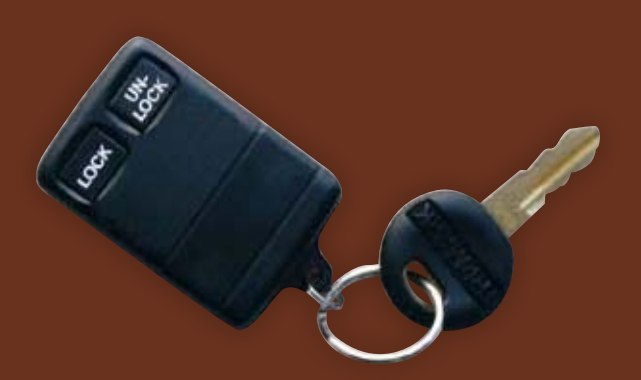
KeyOne The KeyOne<sup>™</sup> system uses a single key to open the entrance, storage compartment and fuel-fill doors. For added convenience, lock and unlock the entrance door with the keyless remote.

The AM/FM RV Radio<sup>®</sup> includes a CD player, weather band and an iPod interface connector. Upgrade to the available Sirius<sup>®</sup> satellite radio package for over 120 digital channels and a complimentary 6-month subscription.