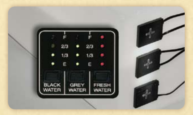
TRUEL'EVEL The TrueLevel holding-tank monitoring system uses sonar technology to read liquid levels from outside the tank. There are no probes to corrode or clog, just accurate readings time after time.