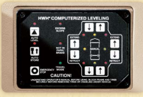
Leveling Jacks Monitor the placement of the available automatic leveling jacks from the controls at the entrance door for quick and easy campground setup.