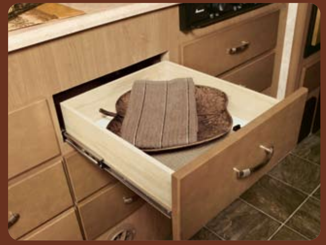
Drawers Full-extension slides allow the spacious drawers to open wide for easy access.