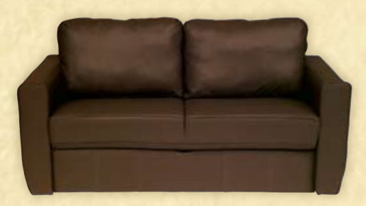
1. By day it's a plush sofa.

The sofa/sleeper you've always wanted is here. Never before has converting your sofa into a bed been so easy—or this comfortable. (NA 29B)