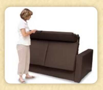
3. At night, the sofa easily folds out into a bed.