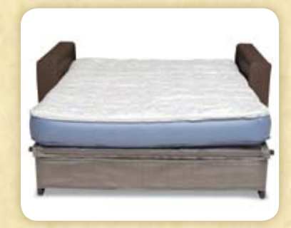
4. The mattress quickly inflates and deflates using a built-in power source.