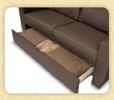
2. A hidden drawer stores bed linens.