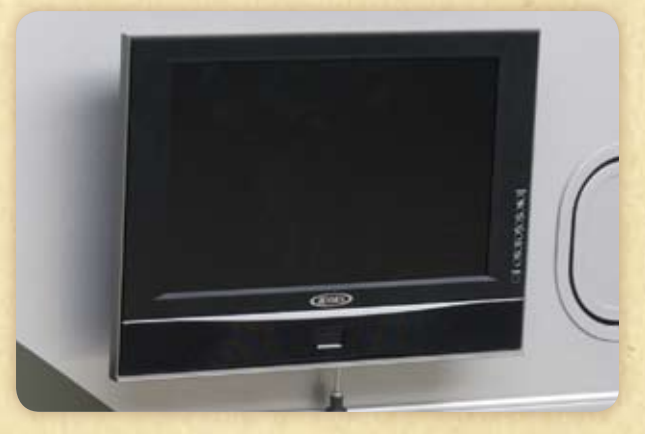
Exterior TV Move the bedroom TV to the exterior mount and enjoy your favorite shows in the great outdoors.