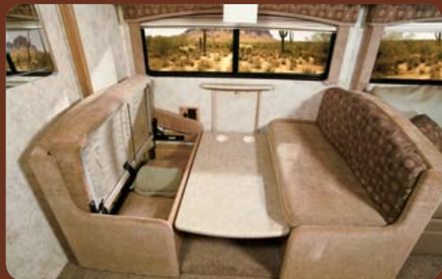
BenchMark The versatile BenchMark® full-comfort dinette features innerspring cushions, flip-up access to storage and an available Dream Dinette™ table that allows for simple, one-handed table height adjustments. It even converts into a bed. An integrated child safety seat tether provides a place for securing car seats.