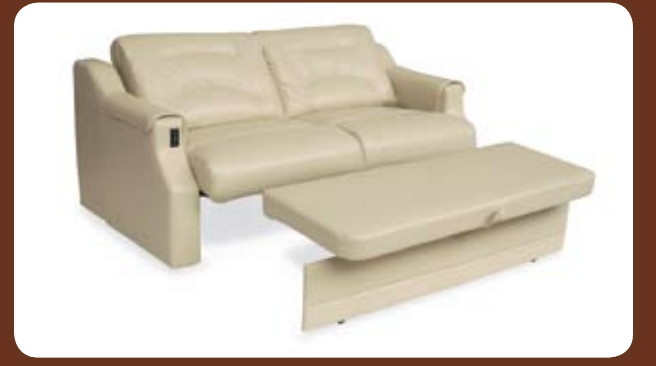
REST EASY® Press a button and the available Rest Easy multi-position lounger glides from a sofa to a recliner to a comfortable bed (30C).