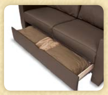
2. A hidden drawer stores bed linens.