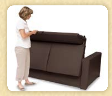
3. At night, the sofa easily folds out into a bed.