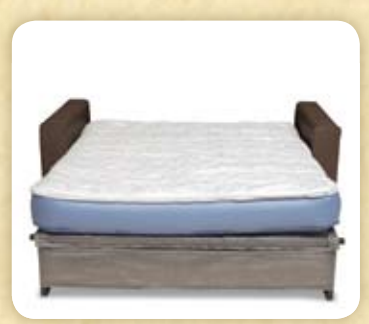
4. The mattress quickly inflates and deflates using a built-in power source.