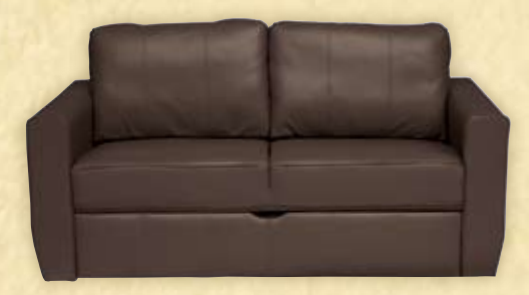
1. By day it's a plush sofa.

The sofa/sleeper you've always wanted is here. Never before has converting your sofa into a bed been so easy—or this comfortable.