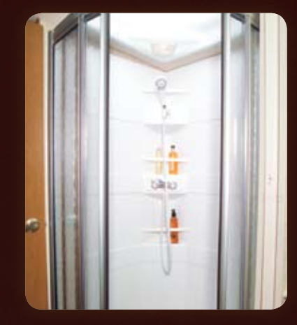
Shower Enjoy a refreshing shower featuring a flexible showerhead, skylight and textured glass doors in the 30C. The 28B offers a retractable shower door that squeegees itself clean.

Bedroom A rear slideout, including this vanity in the 28B, provides plenty of room for you to relax and enjoy your private bedroom. You may not want to leave once you've settled into the available Ideal Rest™ bodyconforming memory foam mattress. From there you can enjoy the available LCD TV, which is wired to the front DVD player so you can watch your favorite movies. A spacious wardrobe holds plenty of clothes for extended trips.