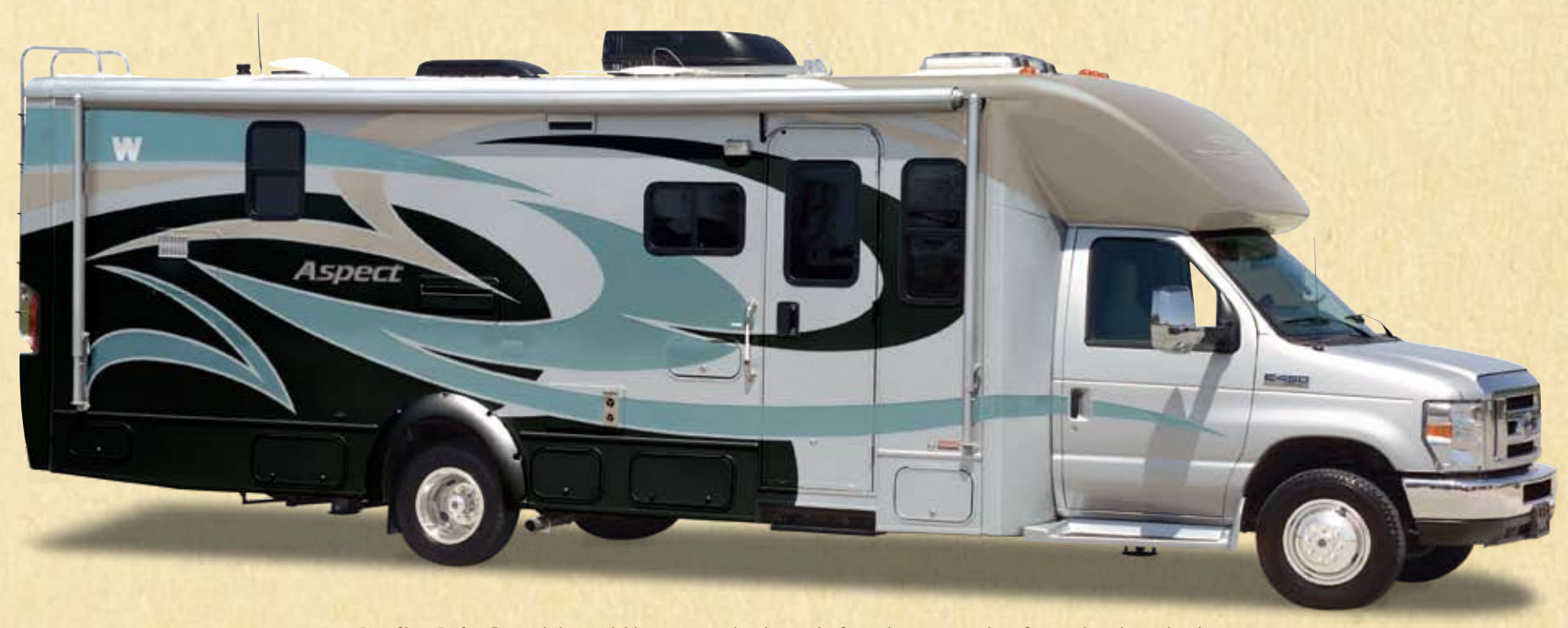
Leveling Jacks Control the available automatic leveling jacks from the entrance door for quick and easy leveling.