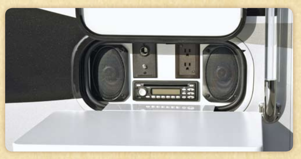
Entertainment Center An available exterior entertainment center includes an AM/FM radio, CD player, remote and a removable table.