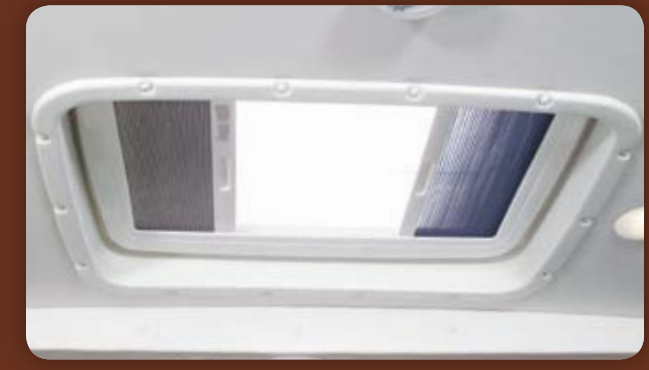
Skylight Stay cool with an available skylight/air vent that includes a built-in shade and screen.