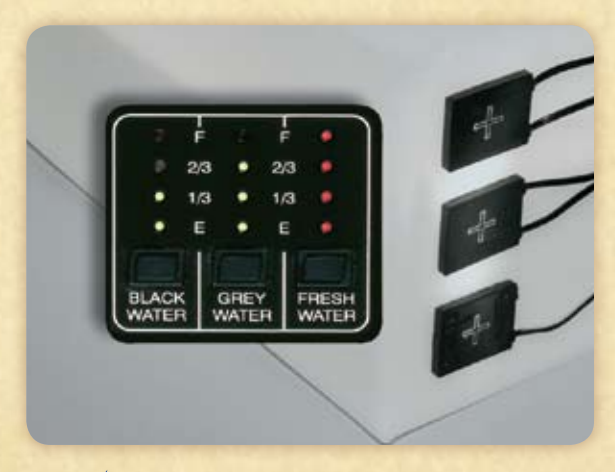
TRUELEVEL The TrueLevel holding-tank monitoring system uses sonar technology to read liquid levels from outside the tank. There are no probes to corrode or clog, just accurate readings time after time.

The radio power switch lets you use the coach batteries to power the cab RV Radio, CD player and weather band, or the available Sirius satellite radio when parked. The Sirius package includes an iPod interface cable and comes with a complimentary six-month subscription.