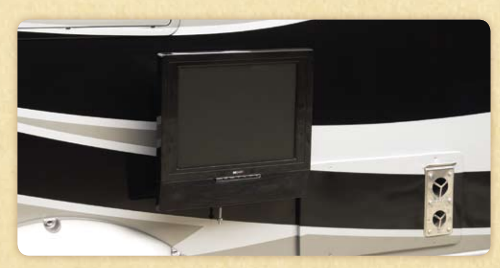
Exterior TV The available bedroom TV can be mounted on an exterior bracket when you are relaxing at the campground.