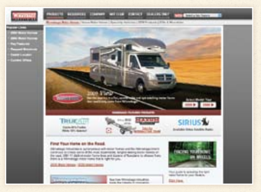
GoWinnebago.com Watch key feature videos, take interactive tours, see the latest promotional offers and a whole lot more at GoWinnebago.com.

The galley offers a full complement of appliances, including a 3-burner range top with storage below and a microwave oven with a vented range hood. Choose the available microwave/convection oven for even more cooking options. Beautiful cabinetry and full-extension drawer slides provide ample storage for all of your kitchen utensils. Enjoy meals at the standard dinette or available BenchMark® full-comfort dinette in the 30C, or the U-shaped dinette in the 28B.