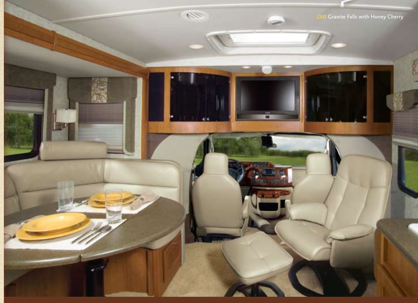
Window Treatments Available cab window blinds open and close smoothly thanks to upper and lower guides that keep the blinds close to the windows for additional interior space. Available thermo-insulated windows provide added thermal efficiency and climate control.