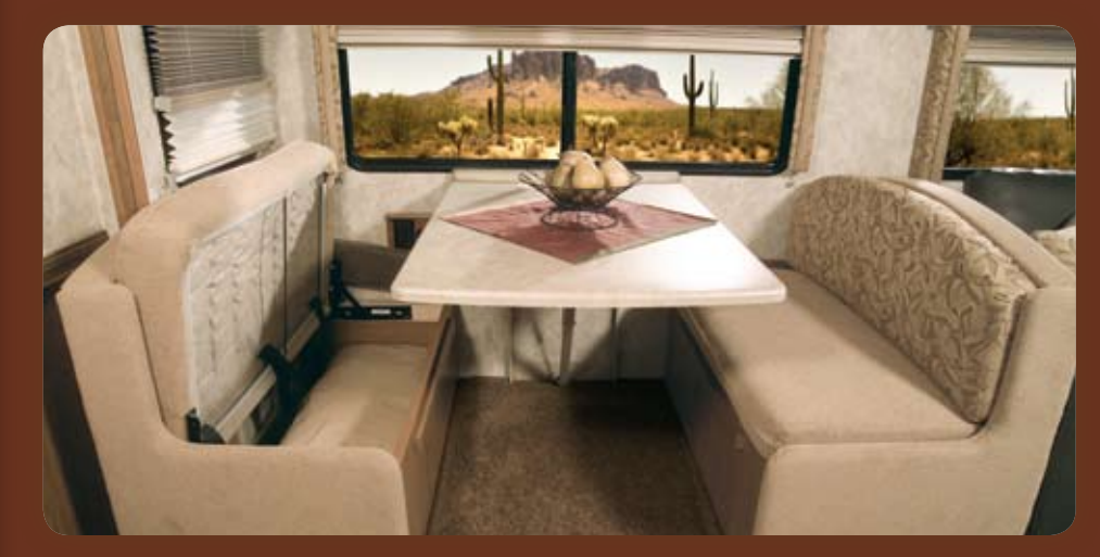
BenchMark * The BenchMark full-comfort dinette features innerspring cushions and is shown here with the upgraded Dream Dinette table, which easily adjusts with one hand to change the height or for quick conversion to a comfortable bed.