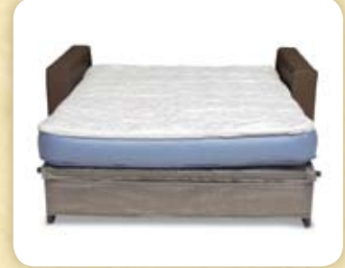
4. The mattress quickly inflates and deflates using a built-in power source.

3. At night, the sofa easily folds out into a bed.