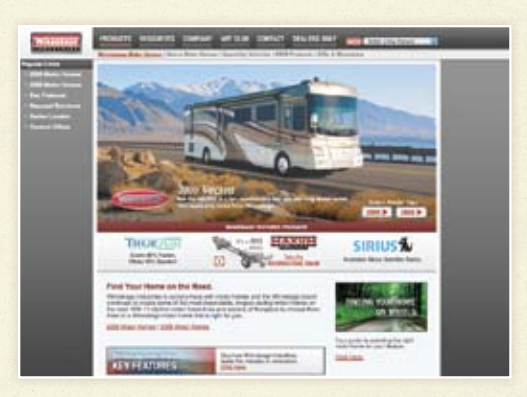
GoWinnebago.com Watch key feature videos, take interactive tours, see the latest promotional offers and a whole lot more at GoWinnebago.com.

Entertainment features include a front overhead 32" LCD TV on the 33C and 35J or a 40" mid-coach LCD TV on the 31E and 37L. The 37L also features a second mid-coach 19" or optional 26" LCD TV. For added flexibility, add an available second 19" front overhead LCD TV on the 31E. All TVs are connected to the dash stereo, which includes a CD/DVD player for your favorite movies. Both the TV and CD/ DVD player run on 12-volt power when generator or shoreline power is not available.