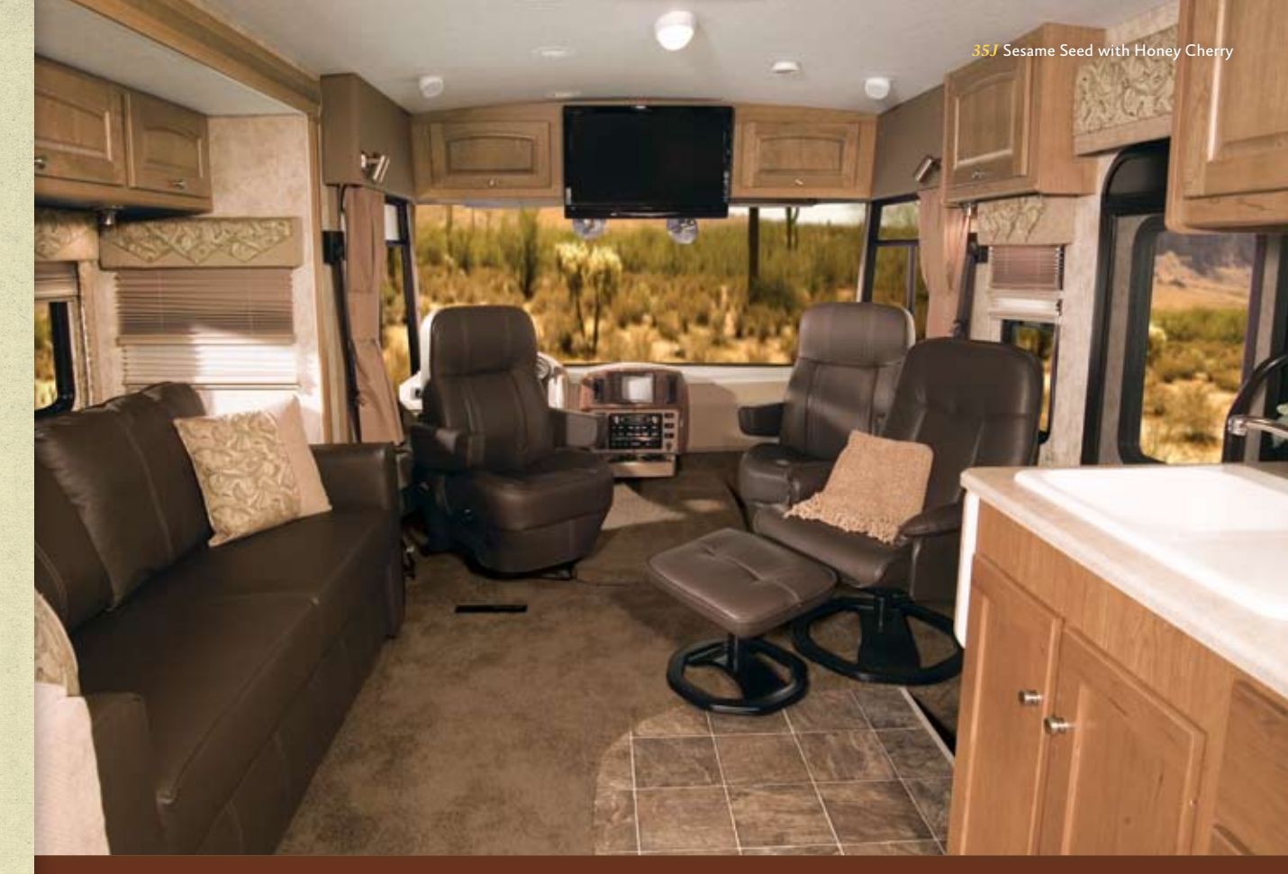
Easy Living Contemporary styling provides a warm and inviting environment. Cab seats swivel and become integral components of the living area.