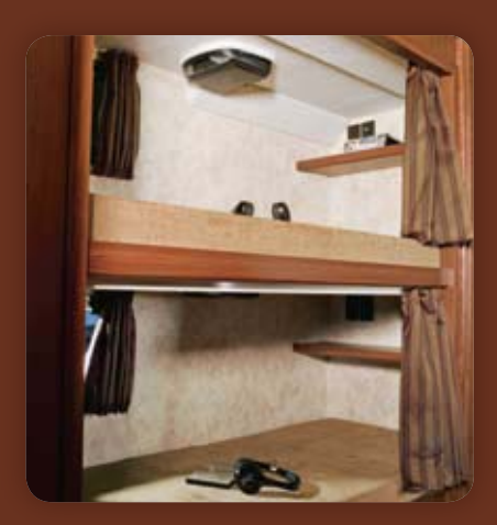
Bunk Beds The bunk beds in the 32K each include a storage shelf and can be equipped with 8.5" LCD monitors, DVD players and headphones.