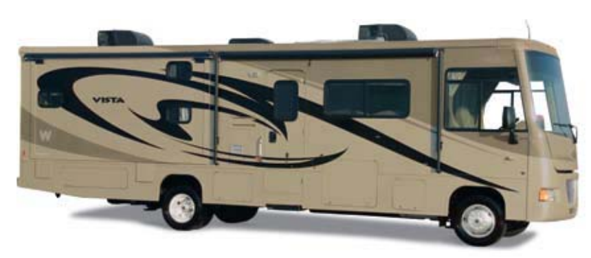
Setup is a Snap Enjoy more time outdoors with the available awning and the convenient service center that makes quick work of hookups and preparation. If you need a break from the heat, two high-efficiency, ceiling-ducted air conditioners provide welcome relief (one A/C unit on the 26P and 30W). Available tinted, dual-glazed windows provide additional thermal efficiency. Smart Storage™ elements, such as the side storage compartment on the 32K, let you bring along all of your gear, including large and bulky items. A winterization package comes standard for convenient, end-of-season prep and hydraulic jacks are available for easy leveling at the campsite. The durable fiberglass roof looks great for years the perfect complement to the available full-body paint.