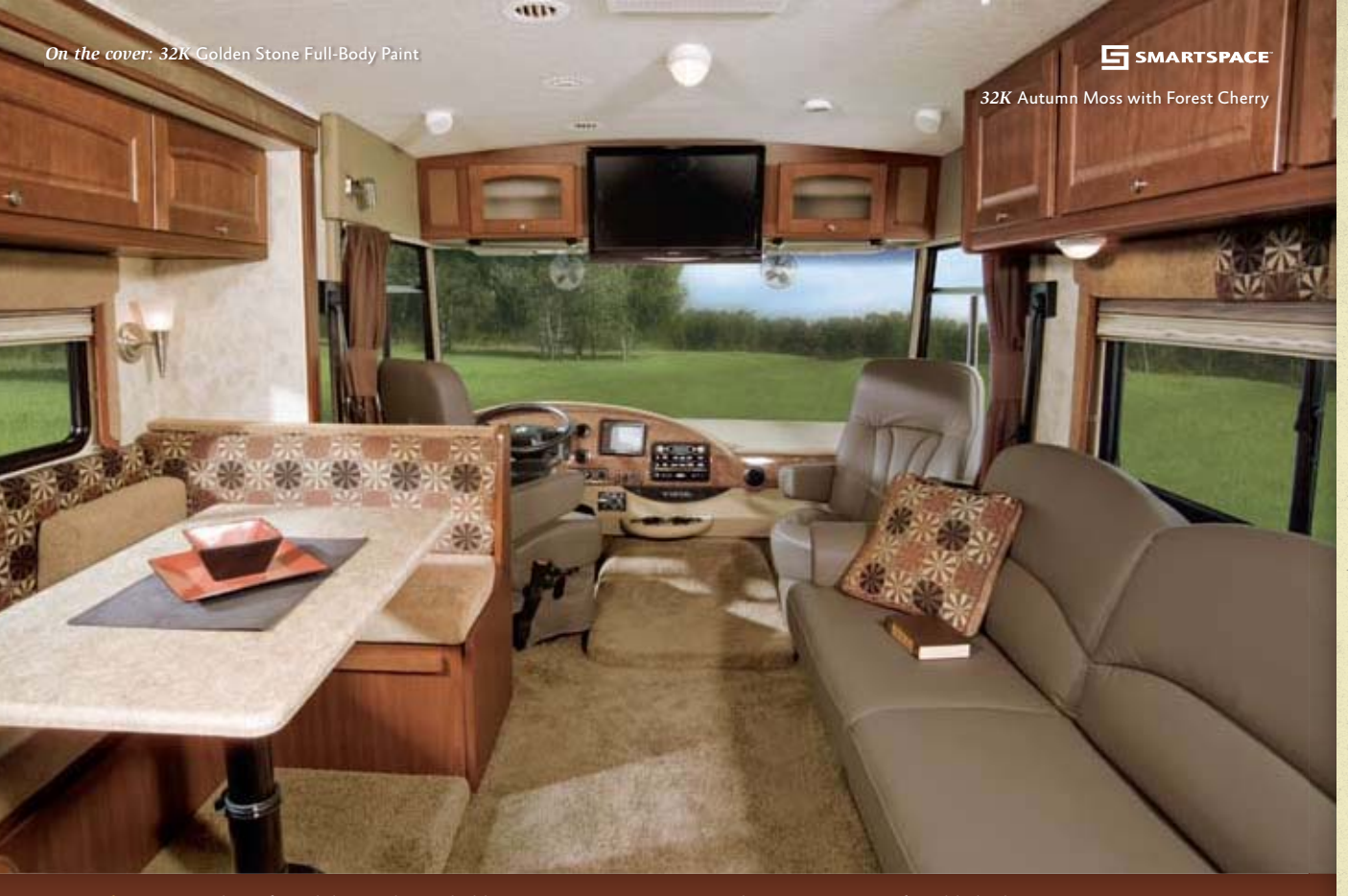
Versatile Seating The sofa and dinette house hidden storage compartments and convert into comfortable beds.