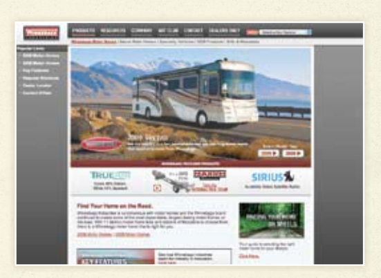
GoWinnebago.com Watch key feature videos, take interactive tours, see the latest promotional offers and a whole lot more at GoWinnebago.com.

The full-featured galley includes a large pantry, spacious countertops, a full complement of appliances and the available microwave/ convection oven.