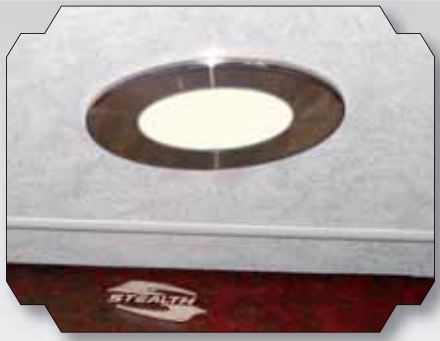
Hi-End Flush Mounted Interior Lighting

FS2512 with Rust Interior and Banzai Cherry Wood cabinetry