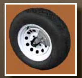
EZ Lube Axles with Radial Tires