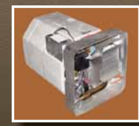
6 Gallon Direct Spark Ignition Water Heater