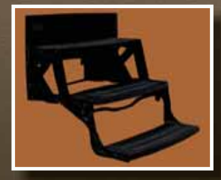
Radius Entry Steps