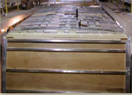
Outback utilizes light weight, long lasting, aluminum framed construction with a patented one-piece galvanized steel roof truss.