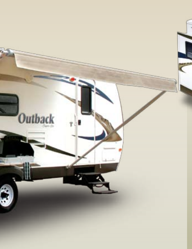
counts the most.

All Outback's are made with I-Beam chassis and full size outriggers. Pretreated in an 11 step process prior to painting ensures more rust resistance than our competitor's chassis.