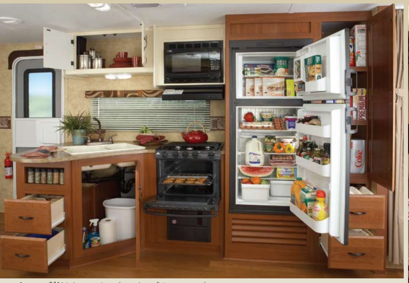
Outback 210BH kitchen allows for an incredible amount of storage space.