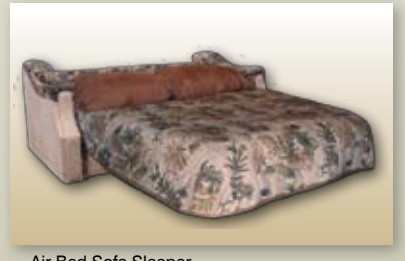
Air Bed Sofa Sleeper