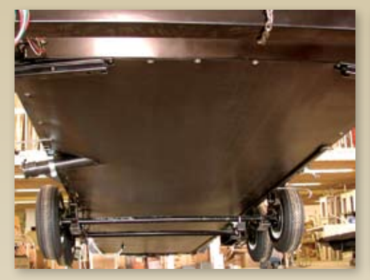
Outback's heated underbelly encloses tanks and valves, helping to extend the camping season.