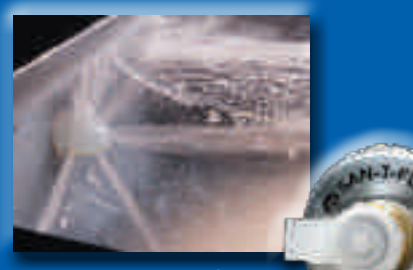
All Black tanks are fitted with SAN-T-FLUSH systems for easy clean out when dumping the waste tank.

All running lights are LED, which emit a more brilliant light for safety, and add a more modern appearance.