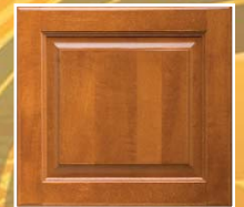
CHERRY Cherry is standard. Hinges are hidden on interior cabinet doors.