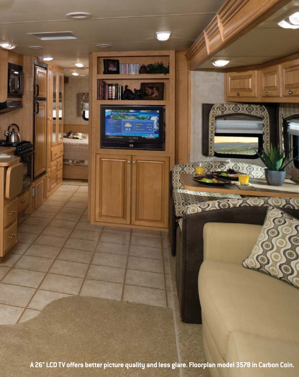
A 26" LCD TV offers better picture quality and less glare. Floorplan model 3578 in Carbon Coin.