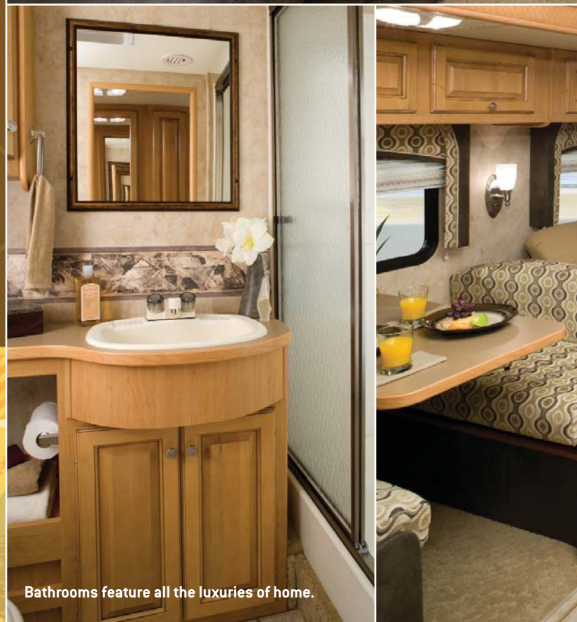
Bathrooms feature all the luxuries of home.