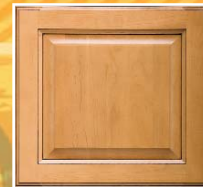
GLAZED MAPLE Solid wood raised panel door and drawer fronts. Maple is optional.