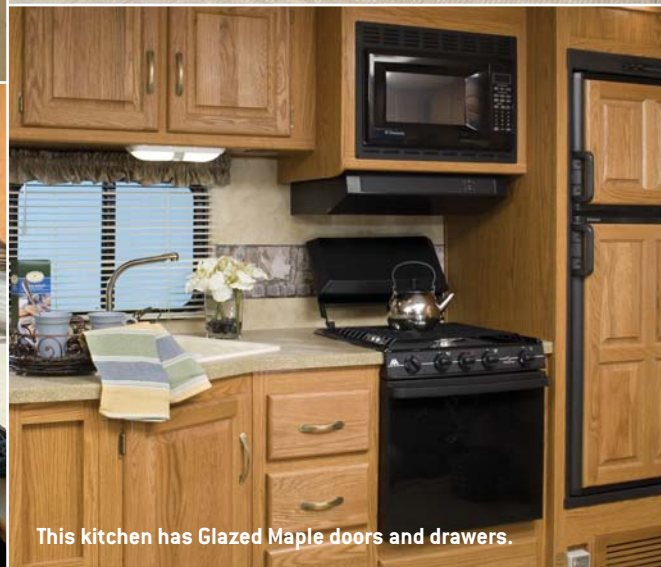
This kitchen has Glazed Maple doors and drawers.