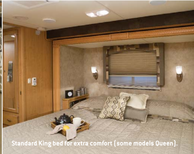
Standard King bed for extra comfort (some models Queen).