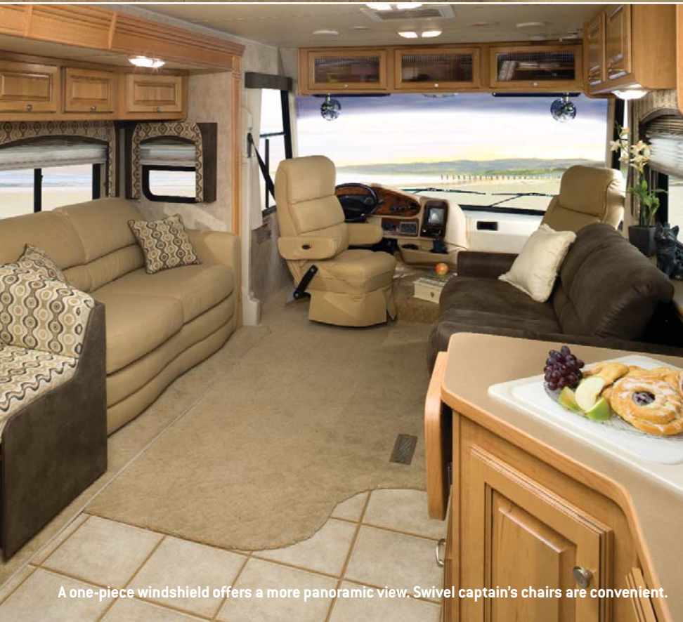
A one-piece windshield offers a more panoramic view. Swivel captain's chairs are convenient.