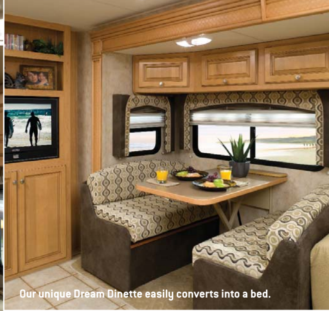
Our unique Dream Dinette easily converts into a bed.