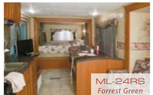
ML-24RS Forrest Green