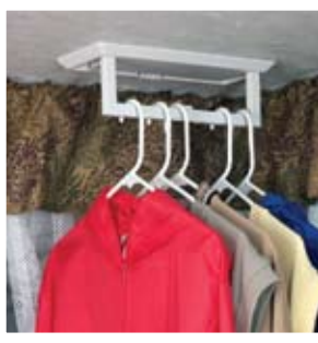
Convenient dropdown clothes bar keeps your clothes neat.