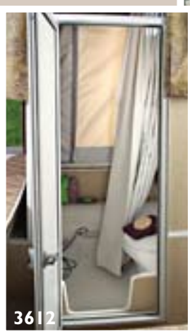
A private indoor shower offers convenience and refreshment.