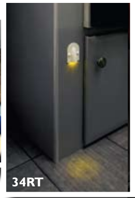
Indirect lighting can save stubbed toes at night.