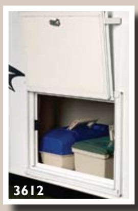
Additional exterior storage is easy to access.