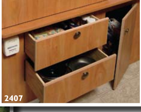
Starcraft campers provide lots of storage areas to help you keep your things neat and organized.