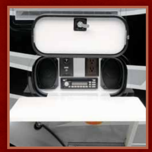
ENTERTAINMENT CENTER An available exterior entertainment center includes an AM/FM radio, CD player, remote and table in a lockable compartment.