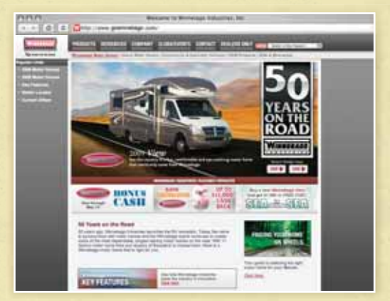
The WEB icon designates a Winnebago Industries Key Feature. For further in-depth information and photos, use the drop-down menu or click on the 'Key Features' page at gowinnebago.com.

An available skylight/air vent with built-in shade and screen, and available thermoinsulated windows provide added thermal efficiency and climate control.