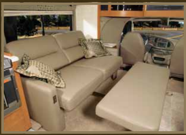
WEB REST EASY® Press a button and the available Rest Easy multi-position lounge glides from a sofa to a recliner to a comfortable bed (30C).