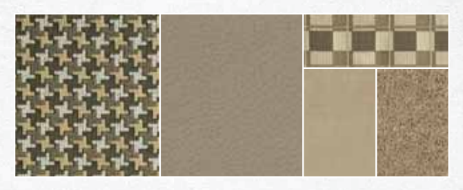
SILVERSCREEN WITH AVAILABLE PUTTY ULTRALEATHER