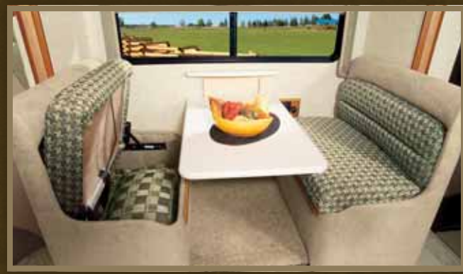
WEB BenchMark¹ The BenchMark dinette on the 30C features innerspring seats that flip up for easy access to storage. The available Dream Dinette™ table easily adjusts with one hand for quick conversion into a comfortable bed. A U-shaped dinette in the 28B offers exterior access to its bench storage.