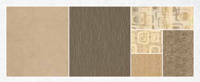
MOONSTONE WITH AVAILABLE PINE CONE ULTRALEATHER