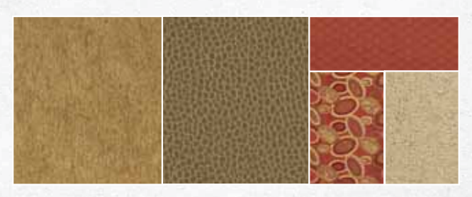
CARNIVAL WITH AVAILABLE FIELDS ULTRALEATHER