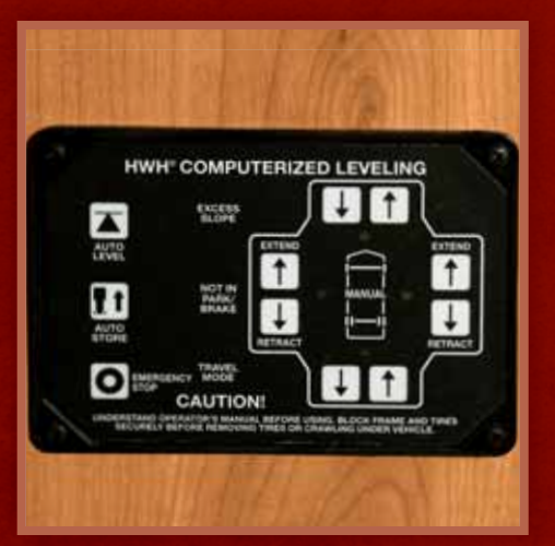
LEVELING JACKS Control the available automatic leveling jacks from the entrance door for quick and easy leveling.