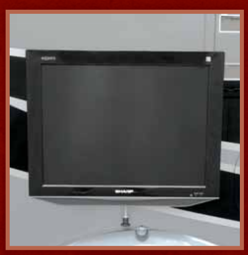
EXTERIOR TV The available bedroom TV can be hung on an exterior bracket when you are relaxing at the campground.