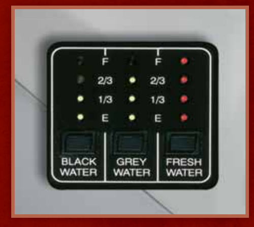
WEB TRUELEVEL The TrueLevel holding-tank monitoring system uses sonar technology to read liquid levels from outside the tank. There are no probes to corrode or clog, just accurate readings time after time.