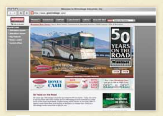
The WEB icon designates a Winnebago Industries Key Feature. For further in-depth information and photos, use the drop-down menu or click on the 'Key Features' page at gowinnebago.com.

To keep you entertained, all models have a 37" LCD TV located mid-coach. You can also add a 26" LCD TV in the front overhead entertainment center for added viewing options. The standard five-speaker home theater sound system brings more life to movies, TV shows and your favorite CDs. A 600-watt inverter lets you enjoy the living area and bedroom entertainment features without shoreline or generator power. Your Destination also comes pre-wired for the available King-Dome<sup>®</sup> satellite system with dual LNBs that accommodates two receivers so you can watch separate digital programs at the same time.