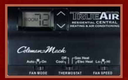
WEB TRUEATR residential central air conditioning with heat pump provides even cooling throughout the coach and delivers 10% more cooling power for 2009.

WEB POWERLINE<sup>®</sup> energy management system monitors electrical usage and cycles appliances on and off to prevent tripped campground circuit breakers.