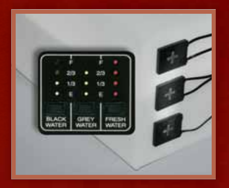
WEB TRUELEVEL holding-tank monitoring system uses sonar technology to read liquid levels from outside the tank. There are no probes to corrode or clog, just accurate readings time after time.