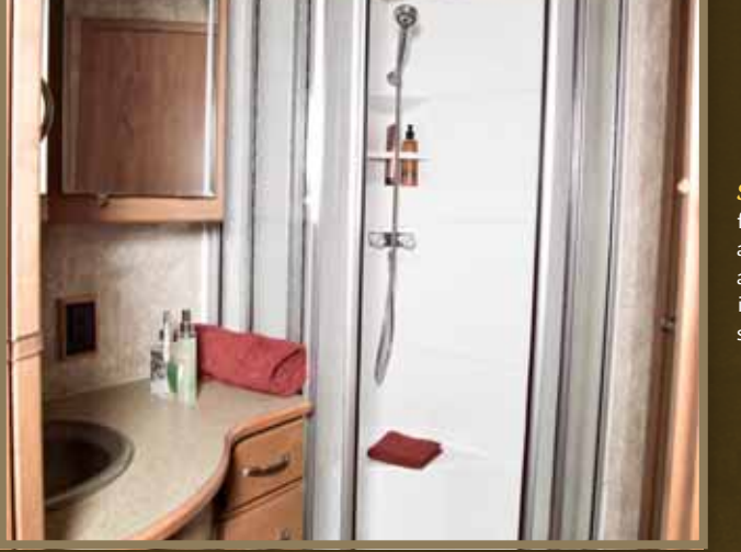
SHOWER The spacious shower features a built-in seat (NA 39N) and an elegant curved door. For added comfort, the showerhead is detachable and features five spray settings.