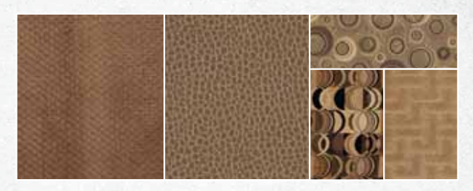
IRON GATE WITH AVAILABLE FIELDS ULTRALEATHER™