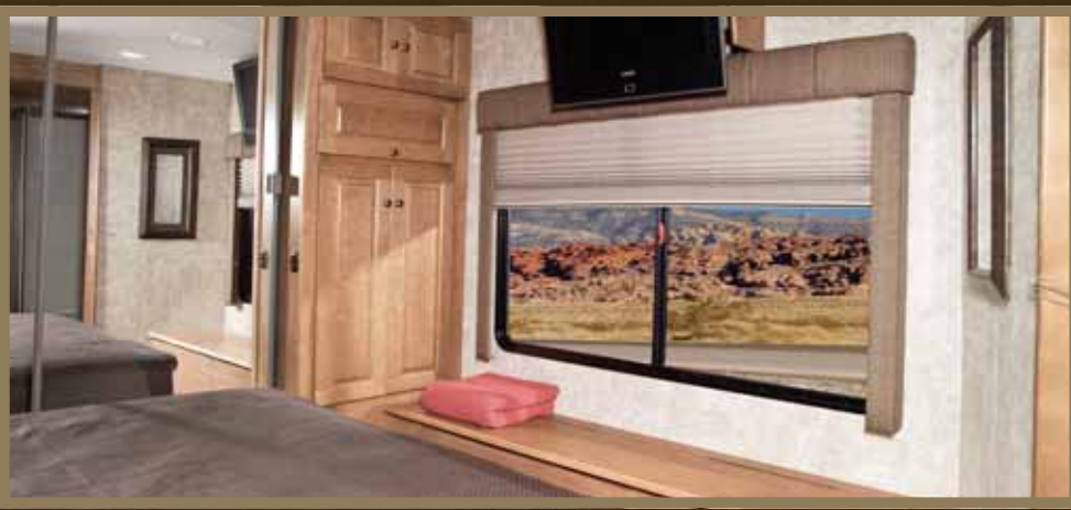
STEREO SYSTEM The bedroom TV connects to the available CD/DVD player, complete with AM/FM stereo, alarm clock, MP3 input and headphone jack.