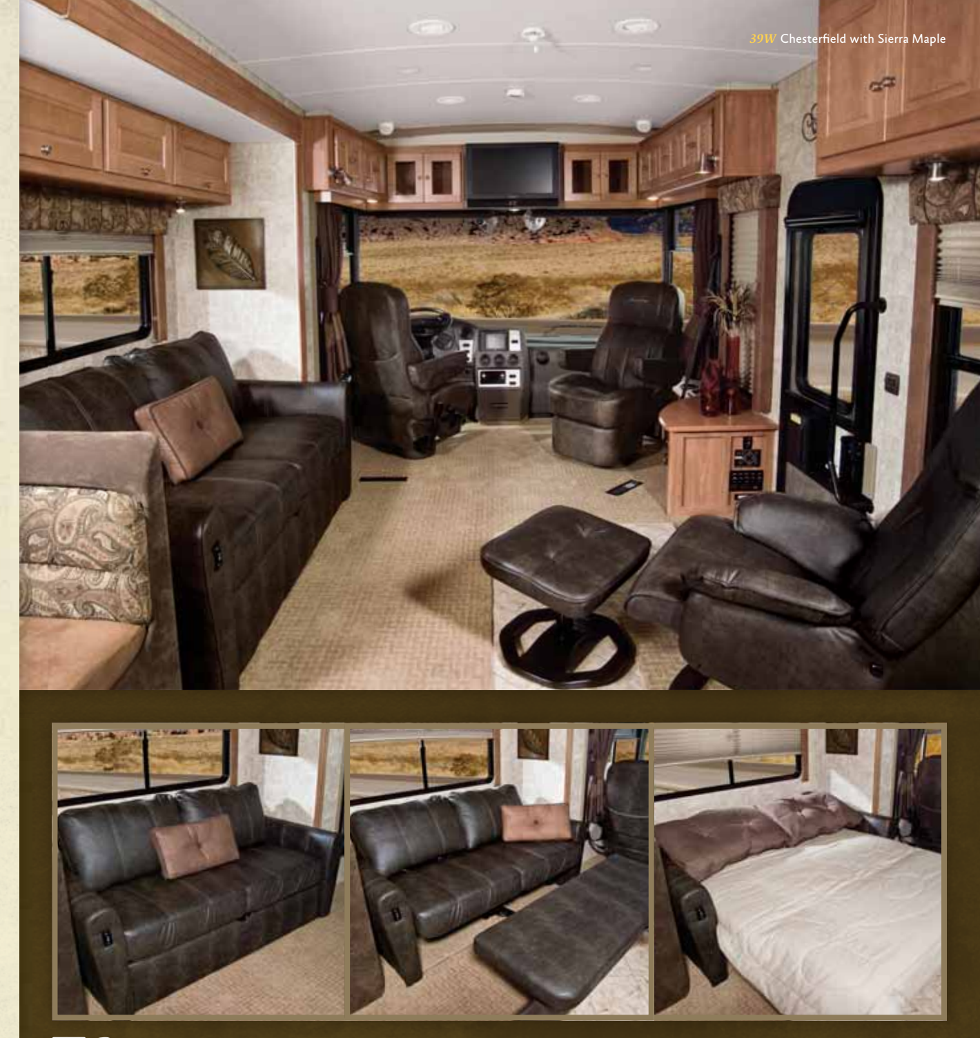
WEB Rest Easy The Rest Easy multi-position lounge glides from a sofa to a recliner to a comfortable bed at the touch of a button.