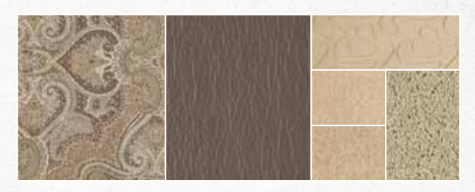
WAKEFIELD W/AVAILABLE PINE CONE ULTRALEATHER™