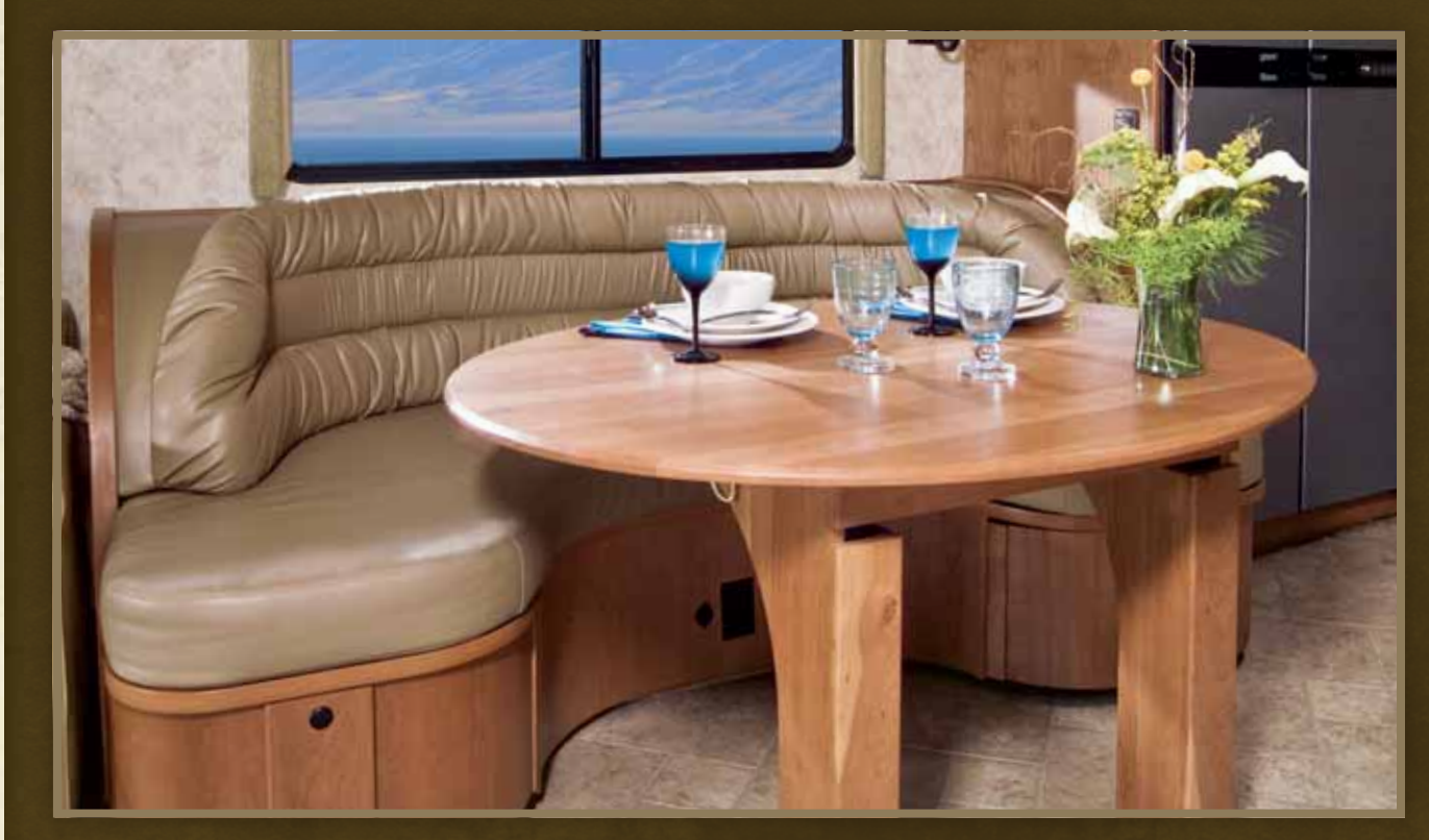
U-SHAPED DINETTE This UltraLeather U-shaped dinette provides elegant dining accommodations on the 40WD. Its sliding table top moves in and out for easy entry. The 40TD gives you the choice of a dining table, buffet with pullout table, or the available BenchMark<sup>®</sup> full-comfort dinette.

The large four-door refrigerator/freezer with icemaker comes standard, or choose the extra-large, two-door, 14 cu. ft., stainless steel refrigerator with an ice and water dispenser. A generous pantry comes standard for your dry goods and a dishwasher can be added for easy clean-up.