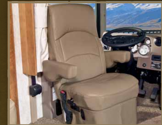
CAB SEAT UltraLeather,<sup>™</sup> adjustable lumbar support and a six-way power pedestal provide maximum comfort. The passenger will also enjoy a footrest and an electric, sliding step well cover.