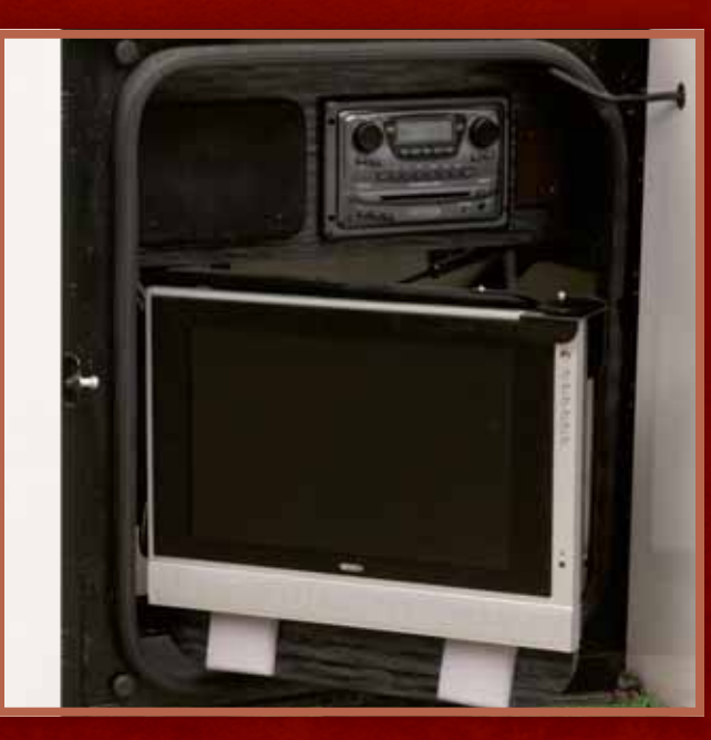
ENTERTAINMENT CENTER Upgrade the exterior entertainment center to include an LCD TV and a DVD player.