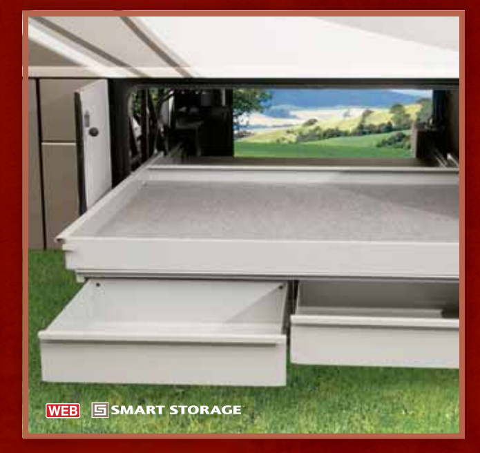
STORAGE TRAY An available sliding storage tray with drawers makes accessing stored gear even easier.