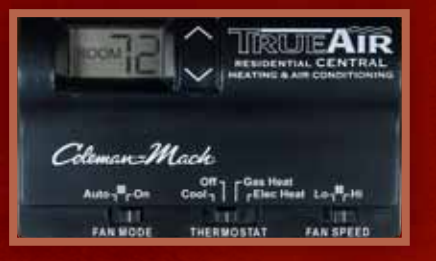
WEB TRUEATR TrueAir residential central air conditioning delivers 10% higher output for 2009 for even cooling throughout the coach without A/C condensation roof runoff.