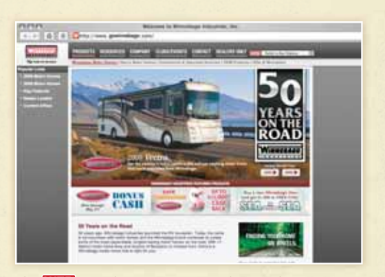
The WEB icon designates a Winnebago Industries Key Feature. For further in-depth information and photos, use the drop-down menu or click on the 'Key Features' page at gowinnebago.com.

The fun continues outside with an exterior entertainment center that includes an AM/FM radio, CD player and a TV jack. Upgrade with an LCD TV and a DVD player to never miss any of the action.