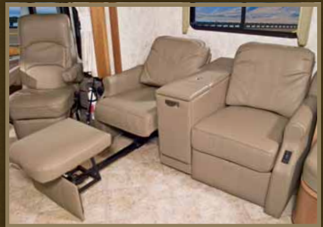
THEATER SEATING Twin recliners with a center console make the available Rest Easy theater seating a popular choice. They quickly convert into twin beds at the touch of a button to accommodate overnight guests.