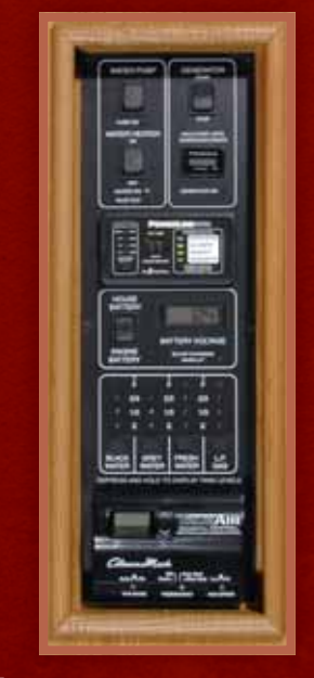
WEB ONE PLACE<sup>®</sup> The OnePlace systems center lets you monitor and control key systems from one convenient location.

Four large-capacity Group 31 batteries provide an extended battery reserve and 33% more amp.-hours for 2009.