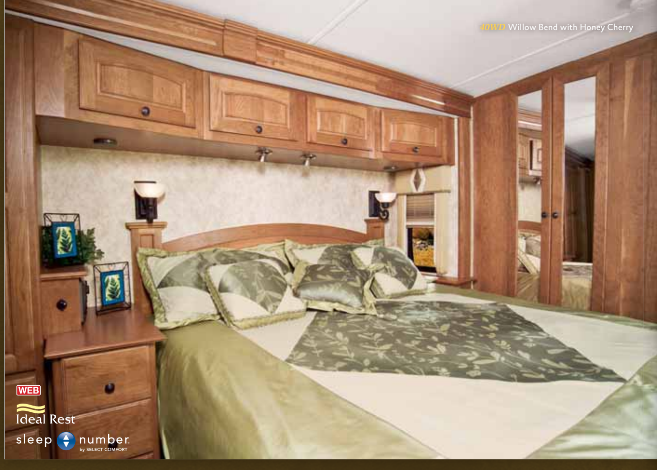
SLEEP NUMBER The available Sleep Number bed by Select Comfort<sup>™</sup> lets you adjust each side of the bed independently to your ideal firmness.

A large bedroom slideout creates a spacious room for sleeping and relaxing. The Ideal Rest<sup>™</sup> body-conforming memory foam mattress provides perfect support for a great night's sleep or choose the available Sleep Number<sup>®</sup> bed. Both come in a standard king size in the 40WD. The bedroom offers an abundance of storage and a 26" LCD TV. It is wired to the bedroom stereo system that features AM/FM radio, CD/DVD player, alarm clock, iPod/MP3 input and a headphone jack.