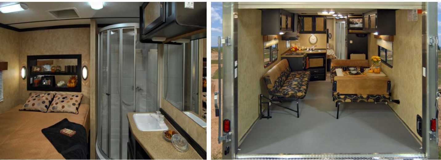
(above) 25' – 23' - 21' UL... gives lots of room for sleeping as well as Toys, also all ½ Ton towable

New for this year is the Ultra Product Line. You will find new and innovative ideas along with new décor packages. Also bringing modern looks and comforts not seen in the past. In this line up we have tried to target lighter trucks while still maximizing carrying capacities.