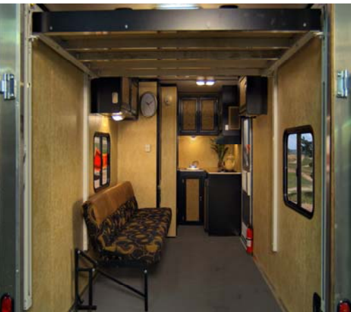
7'x16' depending on how it is equipped is around 3600lb. It is designed for the small SUV's