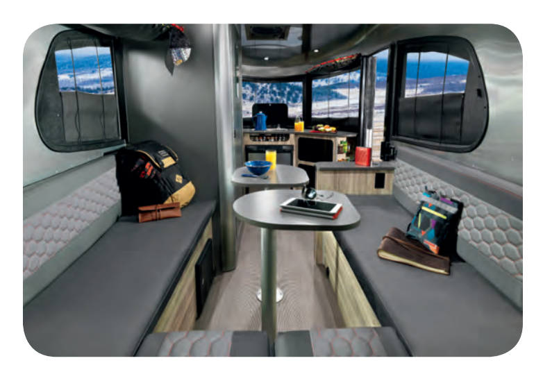
Group seating option - U-lounge seating for 5

It's time to be a little spontaneous. Our most nimble Airstream yet, Basecamp is the very definition of get-up-and-go. It's compact, light, and easy to tow, and the perfect place to land after a day of adventure. Storage is versatile and abundant, sleeping space will surprise you, and you'll still have all the essentials, plus some added luxuries. So get going. Basecamp is ready when you are.