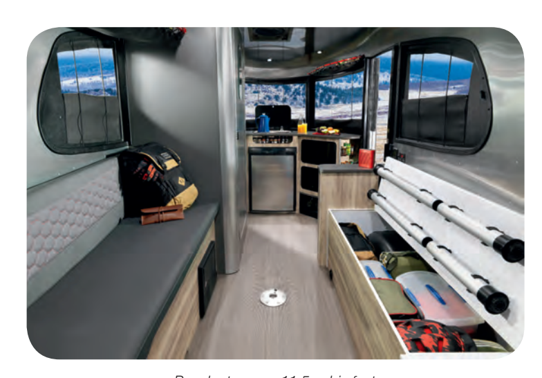
Bench storage - 11.5 cubic feet