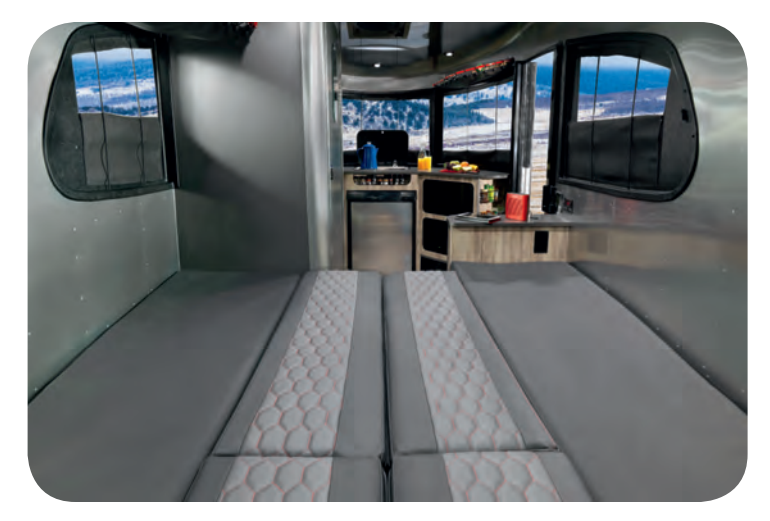
Full bed sleeping option - 76" x 76"