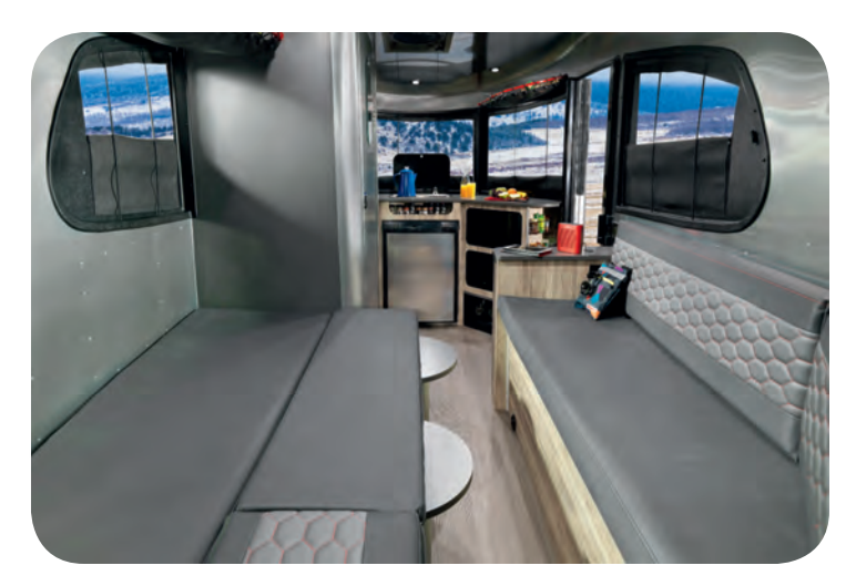
Half bed sleeping option - 38" x 76"