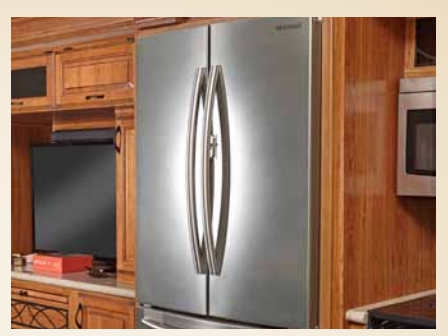
RESIDENTIAL REFRIGERATOR. This stainless steel residential-quality refrigerator (French door style with a 1,000-watt inverter) delivers quality and function. A 12 cu. ft. gas/electric refrigerator is optional.

WASHER/DRYER PREP STANDARD AND OPTION. Solstice floorplans not only come with large bedrooms and wardrobes, but inside the master suite on these fifth wheels you'll find standard washer/dryer prep or add our brand name appliances as an option.