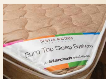
SPACE AGE DENVER MATTRESS®. Our exclusive Denver Mattress® Euro-Top Sleep System® comes as a standard feature. This top-brand mattress cradles pressure points-feels like you're sleeping in zero gravity!