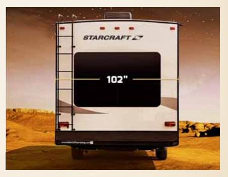
OUR EXCLUSIVE 102"-WIDE CRAFT. Almost all other fifth wheels stop at 96" widths. For the same price or less, we offer 102" widths standard. The extra space is evident in wider hallways and a more expansive living area!

A 60-inch oversized one-piece fiberglass shower with molded-in bench seat features dual shower heads, shelves and expansive twin skylights for star viewing by night, and brightness by day (most models).