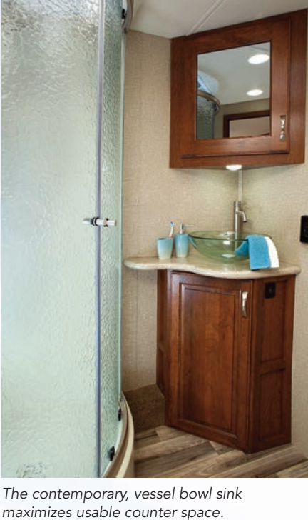
maximizes usable counter space.