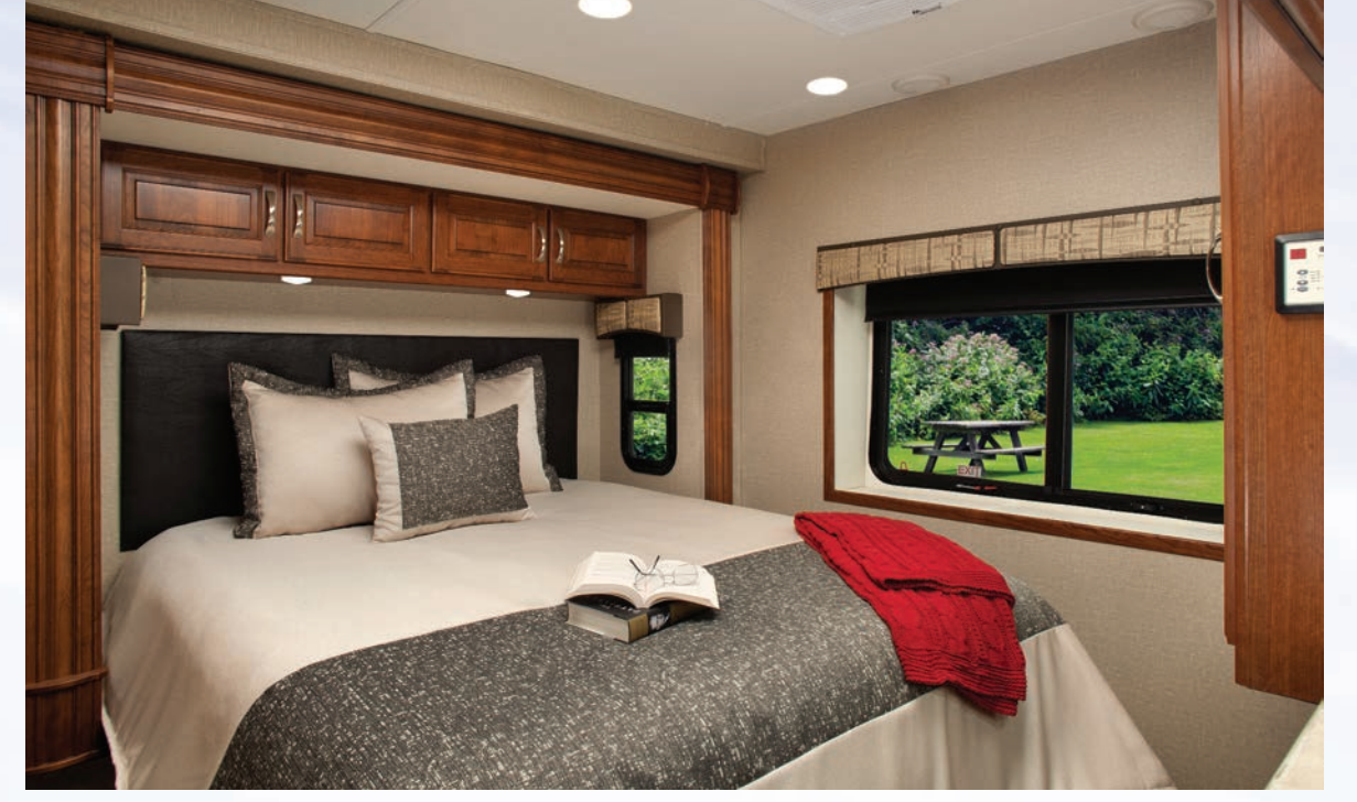
The Isata 36DS master bedroom is furnished with a comfortable king sized i Cool^{TM} mattress. In addition, USB and 110V outlets on both sides of the bed provide convenient charging for all your devices.

Please refer to the chart on the back cover for chart definitions.