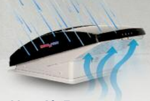
MaxxAir Fans Each standard fan features a built-in rain cover and a multi-function remote.