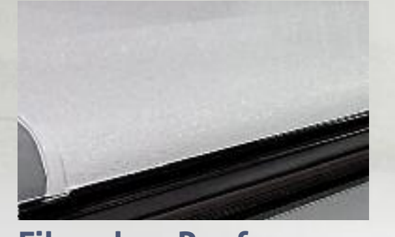
Fiberglass Roof This crowned, one-piece. fiberglass roof is more durable and easier to maintain than TPO or Rubber.