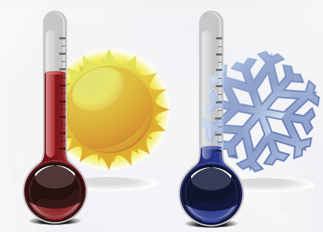
15k BTU Air Conditioner with Heat Pump

SuperLite is lightweight. formaldehyde-free, and unaffected by moisture.