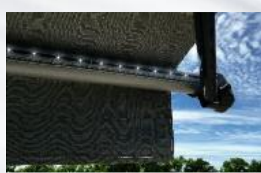
Power Awning with LED Light Strip

The "Soft-Close" feature keeps drawers closed during travel without plastic latches.