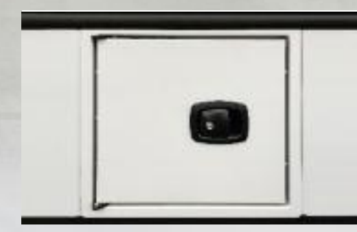
Baggage Doors Our heavy-duty aluminum doors feature metal slam latches.