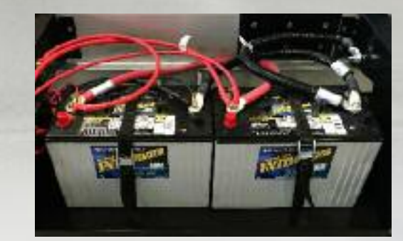
Two AGM Batteries Developed for military aircraft, AGM batteries are more durable, longer-lasting and maintenance-free.