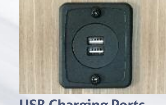
USB Charging Ports

Power your AC devices without shore power or running the generator.