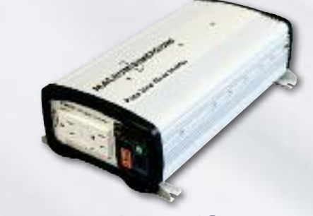
1000W Pure Sine Wave Inverter

This upgraded sway bar ensures better handling in cross winds and a smoother, more stable ride.