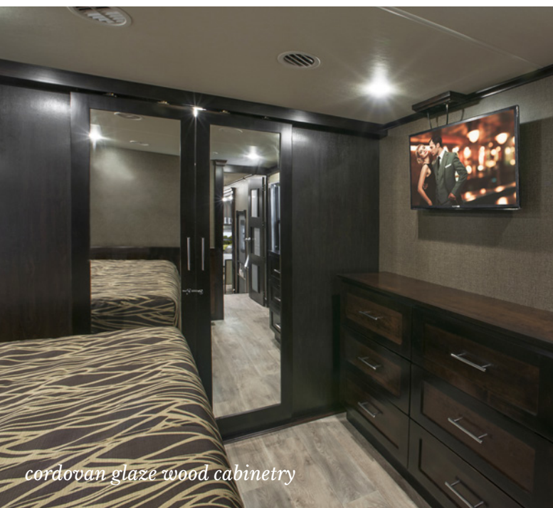
cordovan glaze wood cabinetry