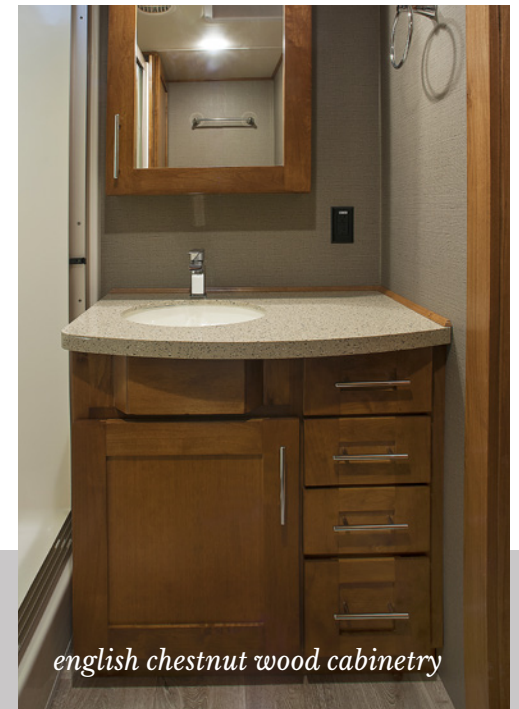
english chestnut wood cabinetry