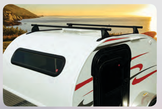
Yakima<sup>™</sup> Roof Rack- Want to slap on a cargo basket, some skis or a kayak? Here's your answer! Available on all models except for the myPod.