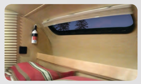
Stargazer Window – Are you looking to bring more light into your trailer or wishing to stare into the night sky? Here's your ticket!