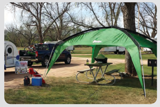
Cottonwood Shelter – Escape the rain or enjoy the shade with this lightweight dome that covers your key camping space.