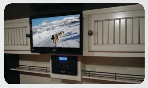
Sight and Sound- AM/FM/DVD Stereo with Bluetooth<sup>™</sup> streaming audio, 12v, 19" LED TV and speakers provide a great entertainment center for all of your audio and video needs.