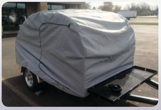
\ensuremath{\textbf{Cover-}} Protect your teardrop from UV, Acid Rain, Sap and much more...