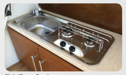
Sink/Stove Combo-Available in the 10' Shadow, this sink/stove combo is a nice alternative that allows you to save on space and capture more storage – all while doing it in style!