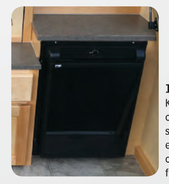
12v Fridge-Keep your food cool in this sleek, black, efficient 1.7 cubic ft upright fridge/freezer!