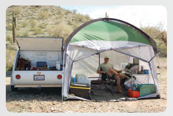
Custom 10x10 Tent- Gain 100 sq. ft. of living space (for your own use or to accommodate guests) with this multi-functional screen room & tent.