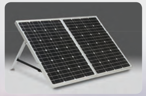
Solar Panel – Chase the sun and keep your trailer powered at all times! *Every trailer that leaves our building is prepped for solar charging.