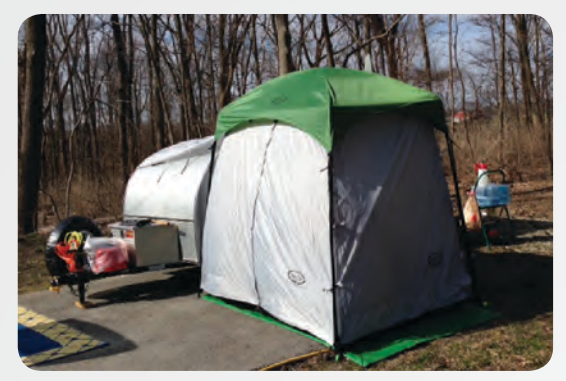
Custom 5x7 Tent- A smaller version of the 10x10 but with all the same benefits, specifically speaking, a place for privacy!