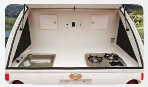
Sink & Stove- Brushing your teeth, rinsing off your dishes and cooking your food was never so easy – thanks to a large rectangular sink and 2 burner stovetop!