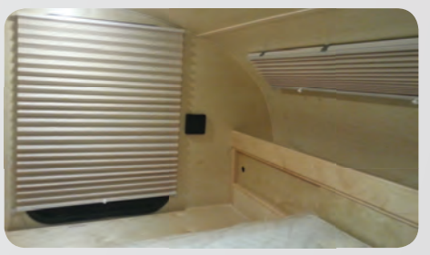
Window Shades- Who knew owning a teardrop would attract so much attention? Whether it is the sun or a set of eyes, these accordion night shades will keep them from peering in!

Some features above are standard on select models and packages. They may not be available on all units based on design.