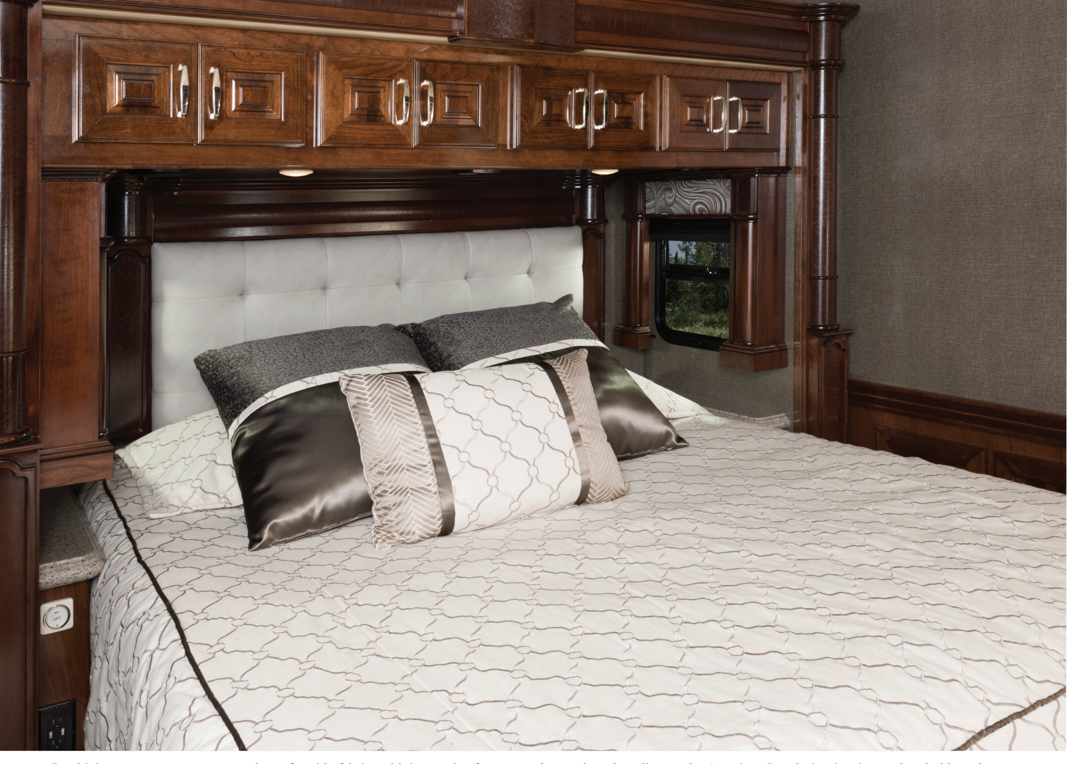
Combining extravagant textures and comfortable fabrics with innovative features and name brand appliances the American Revolution inspires and emboldens those looking for something more.