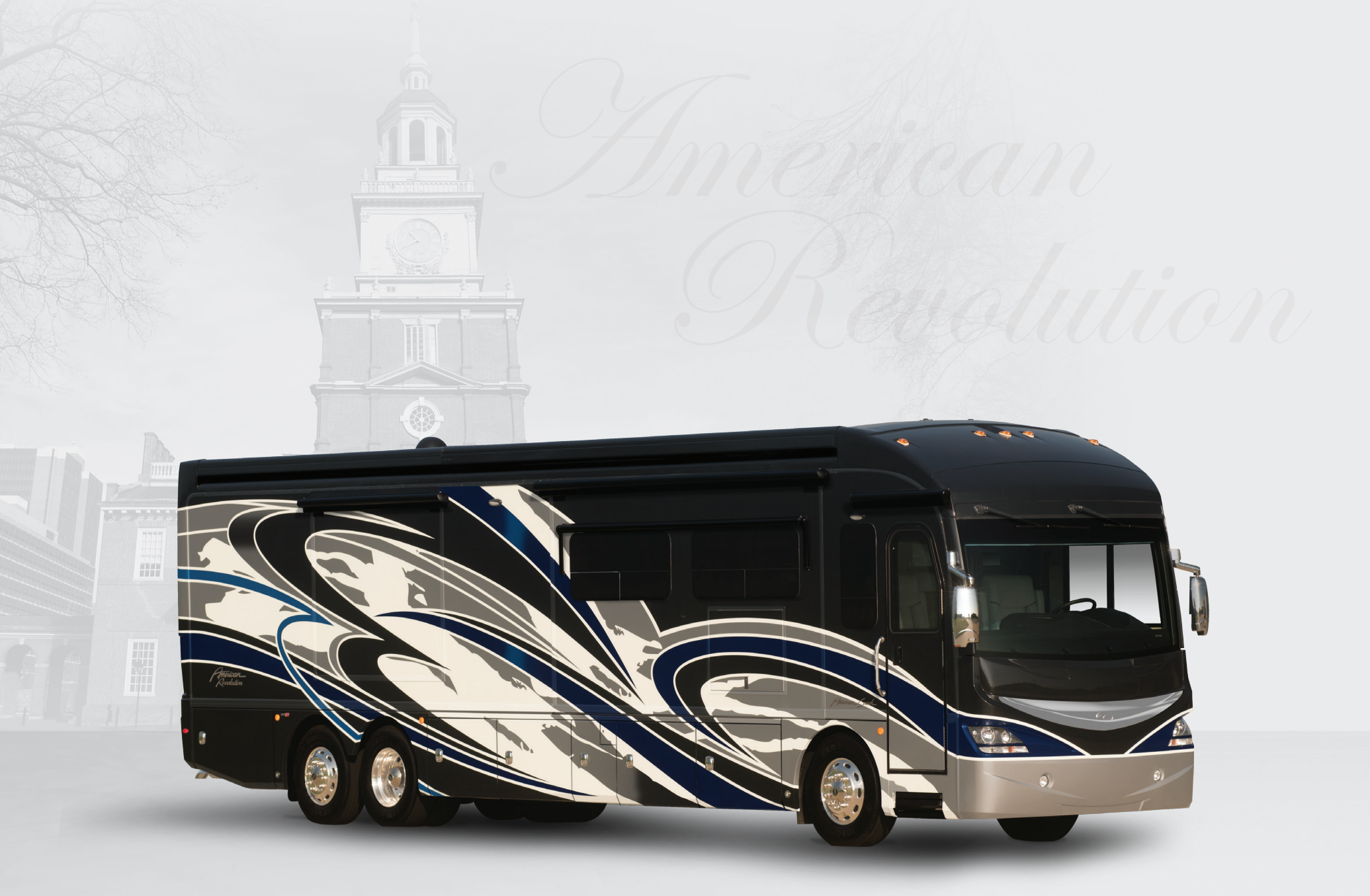
JULY 4, 1776 Following the Revolutionary War, the Declaration of Independence was signed on July 4, 1776 in Philadelphia — dubbed "America's Birthplace." Here, many of our freedoms were realized. The Greater Philadelphia region is home to the Independenc Hall, as well as countryside Revolutionary War sites.