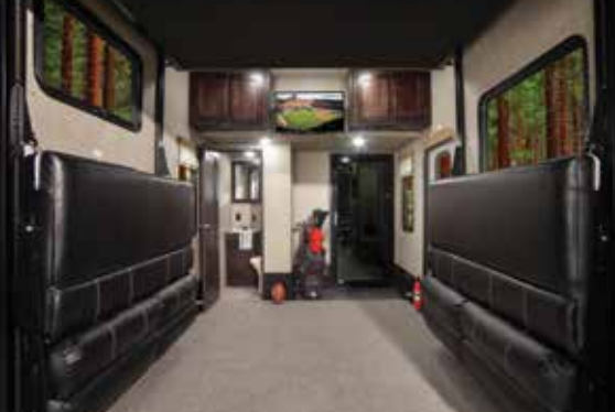
FLIP-DOWN HAPPI-JAC SOFAS MAKE IT EASY TO ENTER AND EXIT THE GARAGE AREA

THE GARAGE EASILY TURNS INTO THE BEST LIVING/SLEEPING AREAS IN THE MARKET