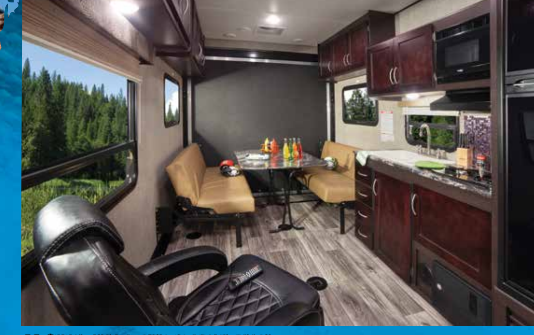
22 LIVING AREA SHOWN IN STONE DECOR