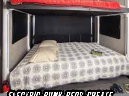
ELECTRIC BUNK BEDS CREATE THE ULTIMATE BUNK HOUSE