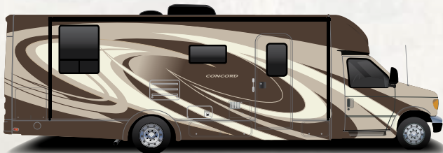
Toffee Full Body Paint (optional)