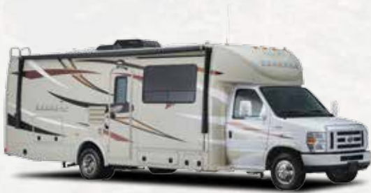
Color-infused Fiberglass (Standard)