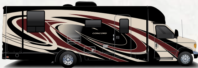
Vermillion Full Body Paint (optional)