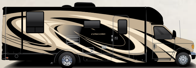
Black Sand Full Body Paint (optional)