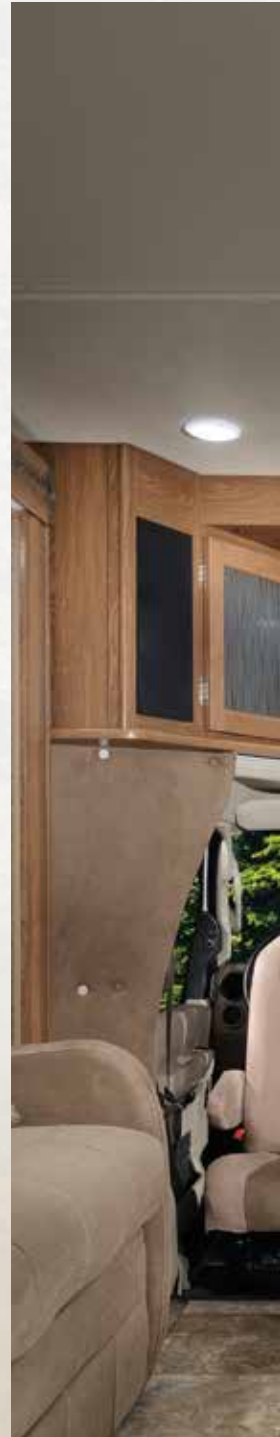
300DS shown with Cocoa Ash cabinets and Linen décor w/Optional Fireplace • Residential Countertop Space w/Double Bowl Sink and Cover.