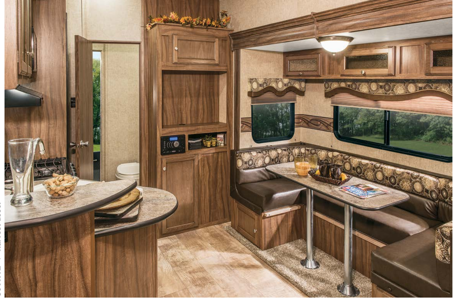
Sportster's main living spaces boast huge windows for excellent lighting and views, roomy dining areas that offer storage underneath and convert to additional sleeping spaces, and overhead storage areas.