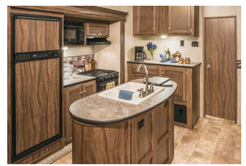
Kitchens boast generous countertop space and storage galore. Island models provide even more storage opportunities and floorplan flexibility.