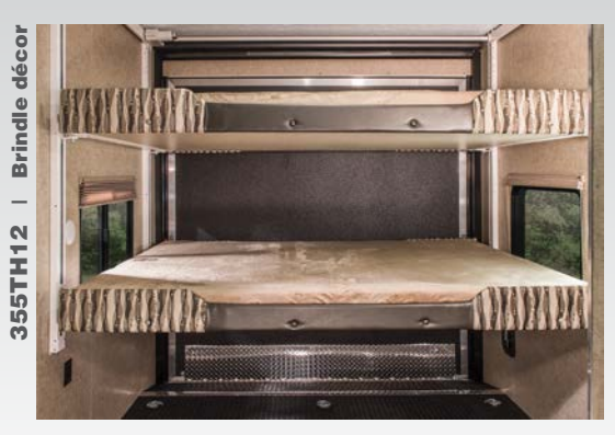
(Above) Optional dual power beds allow for additional sleeping and storage.

(Right) Ramp transitions include a beaver tail for easy loading.