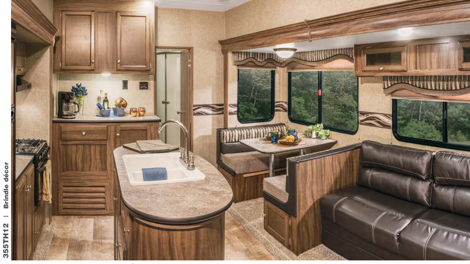
The 355TH12 is a great spokesman for Sportster's fifth wheel group. First thing you notice are the huge picture windows, which offer cross ventilation, lighting and unbelievable views. Five-inch dinette cushions are standard, and dining areas offer additional sleeping space.