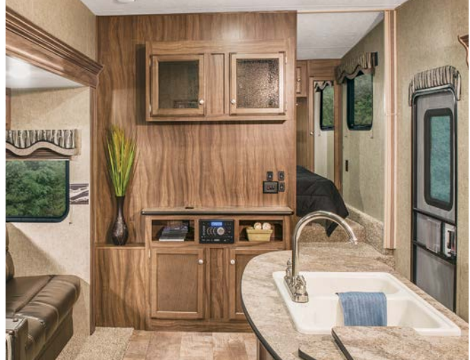
Almost any size TV will fit in Sportster's entertainment center, which includes an AM/FM/CD player and storage above and below.