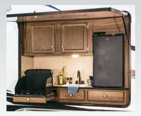
The 355TH12 offers an outside kitchen with refrigerator, sink, over/under storage and pullout camp stove.