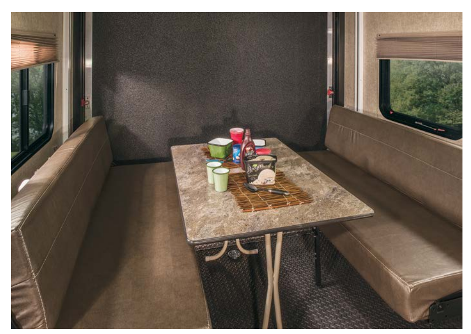
Since Sportster is officially a toy hauler, you can of course store your toys in the garage area, but it's really a multi-purpose room with giant picture windows, perfect for sleeping, eating, providing additional storage, and playing games with family and friends.