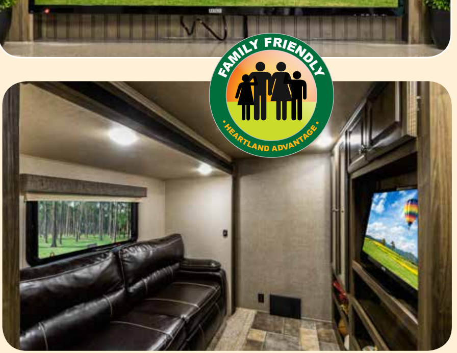
Oakmont features family friendly models where the kids have their own place, sleeping arrangements for the whole family and even a few guests.