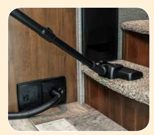
Built-in central vacuum system