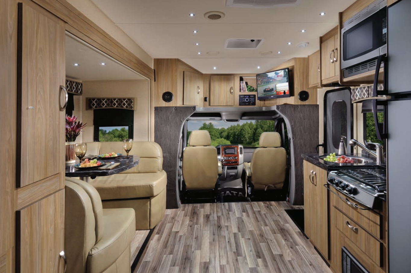
24FW shown with Pebble Décor and Delta Dust Cabinets.

At Dynamax, reaching a higher standard is not an option, it's a tradition.