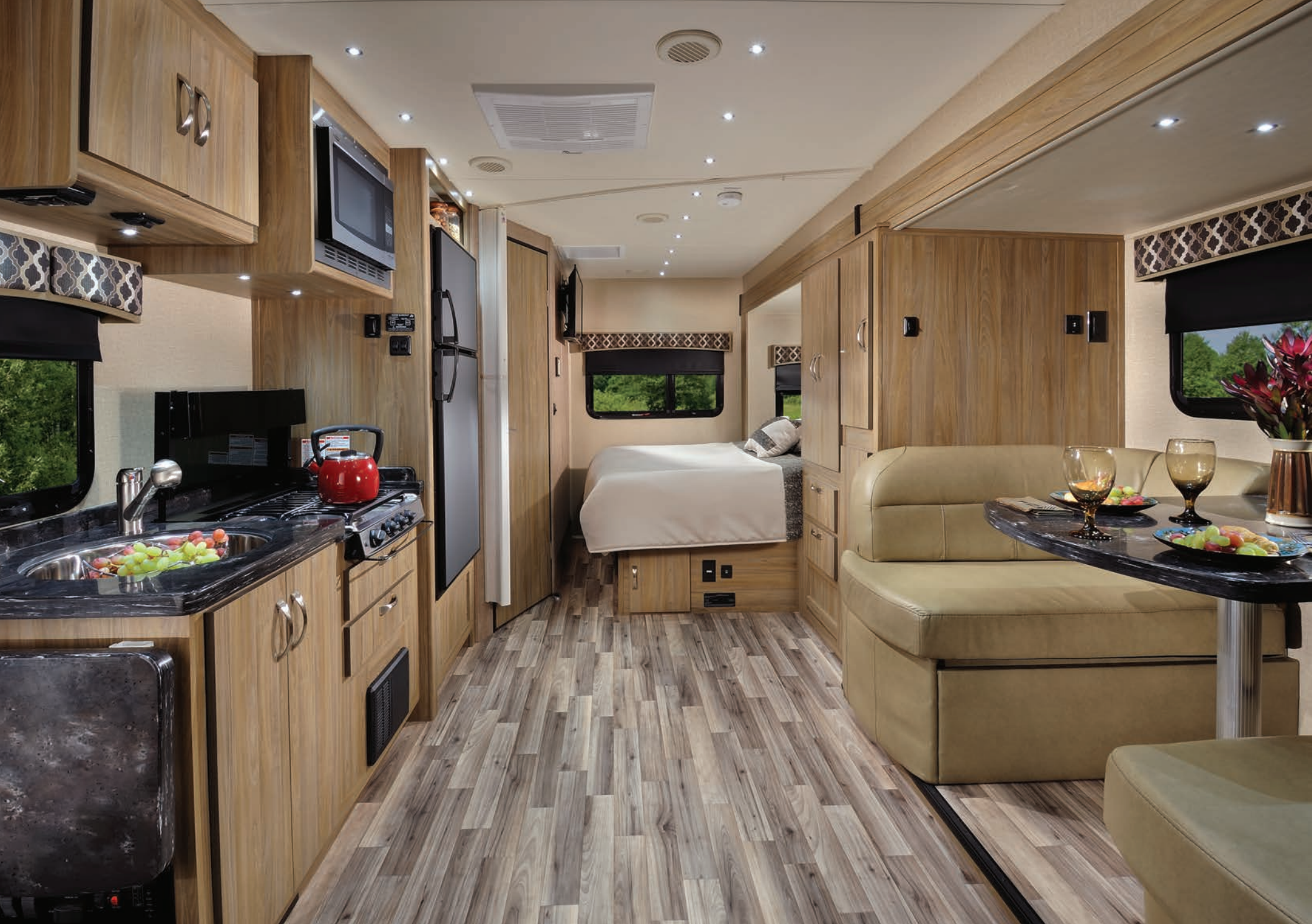
Built on the nimble Mercedes Sprinter, the Isata 3 drives small but lives large. 24FW shown above with Pebble Décor and Delta Dust cabinets.