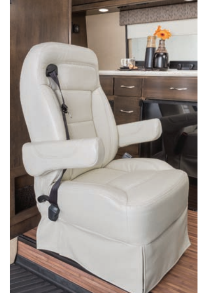
Quick release removable mid-chair

Large wet bath features chrome fixtures, ceramic toilet and custom molded fiberglass shower surround.