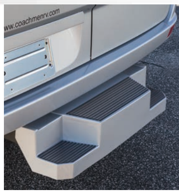
Optional rear hitch cover is a convenient step