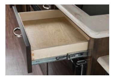
Solid maple drawers with dovetail construction