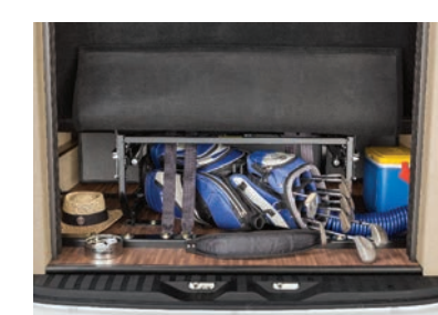
Under sofa storage (24SQ and 24ST)