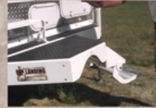
2. Treads fold up....