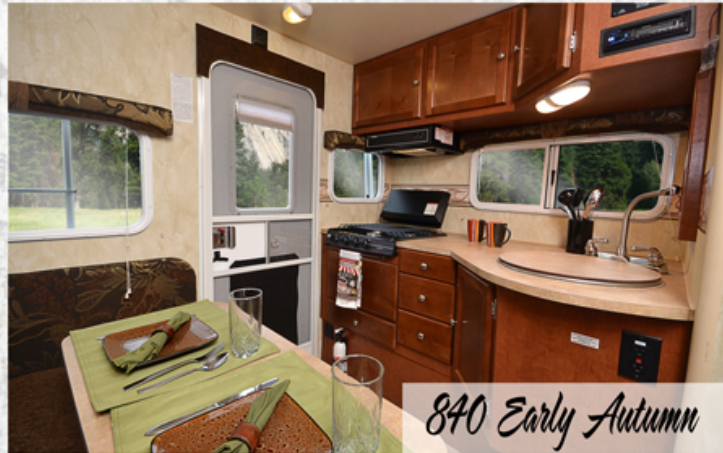
840 Early Autumn