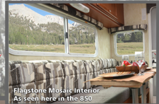
Flagstone Mosaic Interior As seen here in the 850