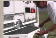
3. Landing folds up, and pin locks it into place