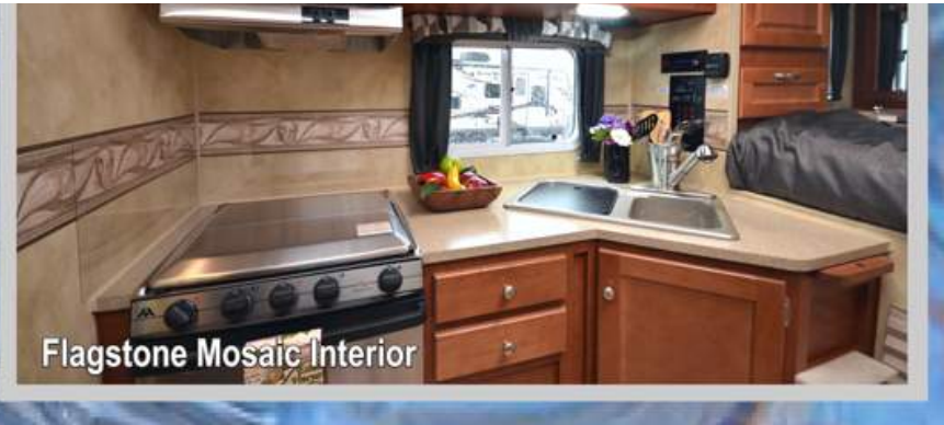
Flagstone Mosaic Interior