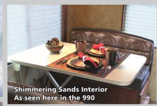
Shimmering Sands Interior As seen here in the 990