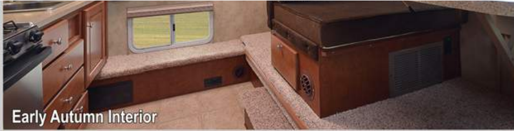
Early Autumn Interior