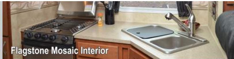
Flagstone Mosaic Interior