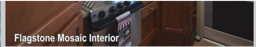
Flagstone Mosaic Interior