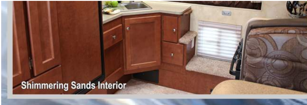
Shimmering Sands Interior