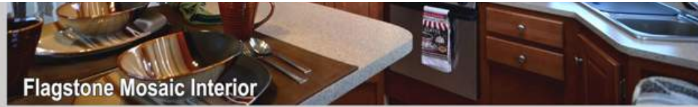
Flagstone Mosaic Interior