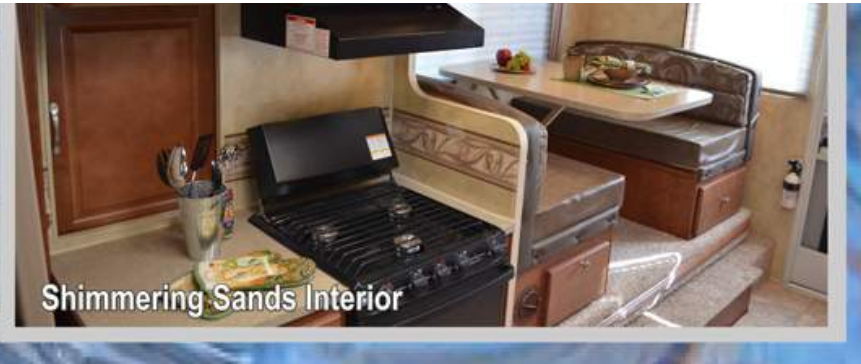
Shimmering Sands Interior