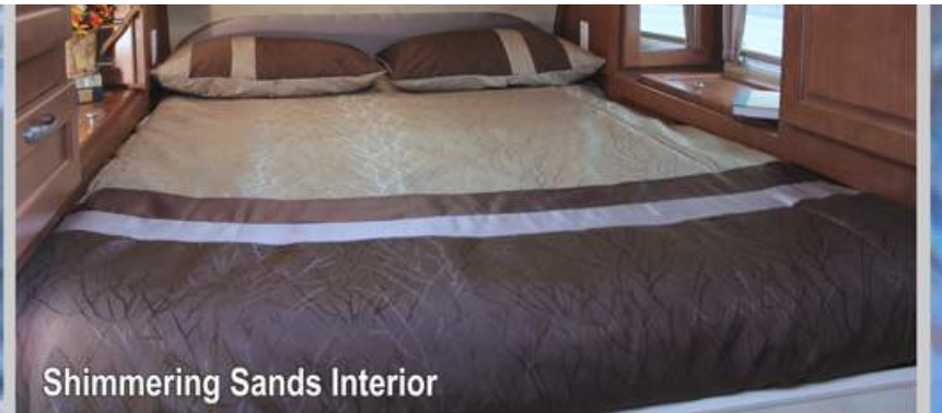
Shimmering Sands Interior