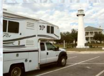
Kim and Dan Rounsley

We purchased the Arctic Fox 990 as our first camper, and we couldn't be happier with this choice. Our initial trip was 9,000 miles in two months. We were perfectly comfortable with the accommodations. It has everything we need in a small, agile package. The quality of construction is evident. We tested the "four seasons" functionality with freezing weather in Yellowstone and simmering heat in Texas. We're on the road again now, touring the Southwest before bringing it home to Alaska. We look forward to many more years of exploring in this truck camper.