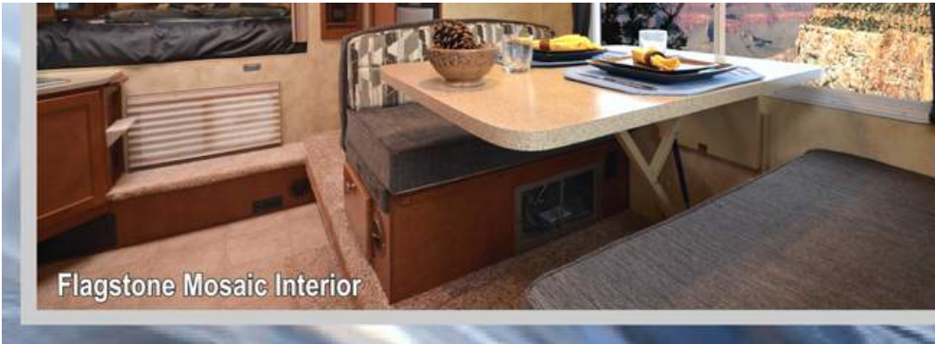
Flagstone Mosaic Interior