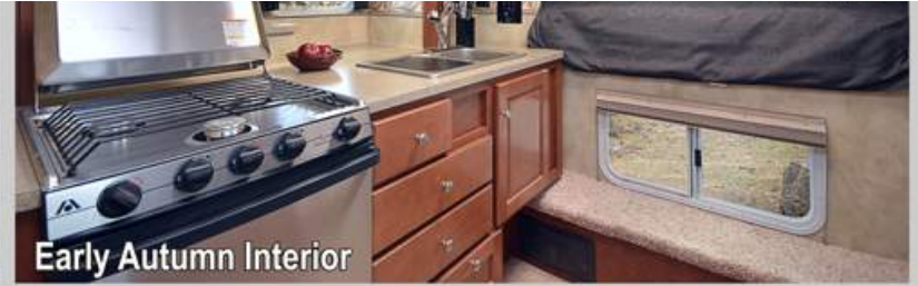
Early Autumn Interior