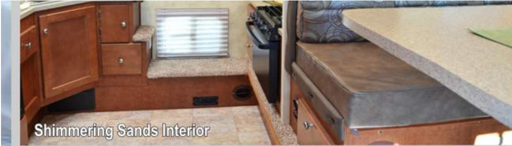
Shimmering Sands Interior