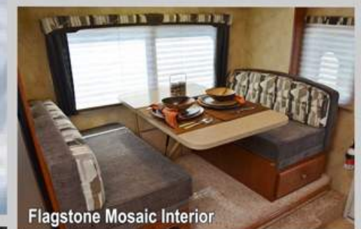
Flagstone Mosaic Interior