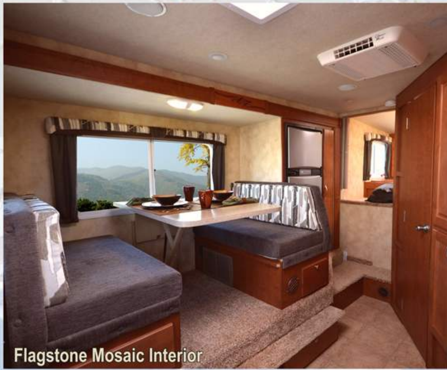
Flagstone Mosaic Interior