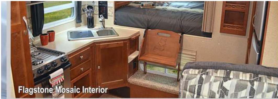
Flagstone Mosaic Interior