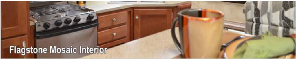
Flagstone Mosaic Interior