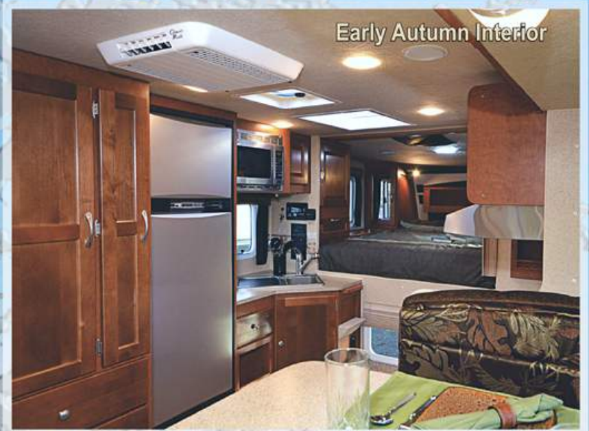
Early Autumn Interior