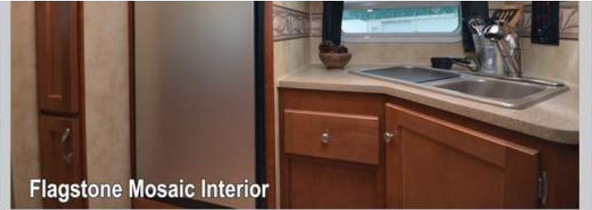
Flagstone Mosaic Interior