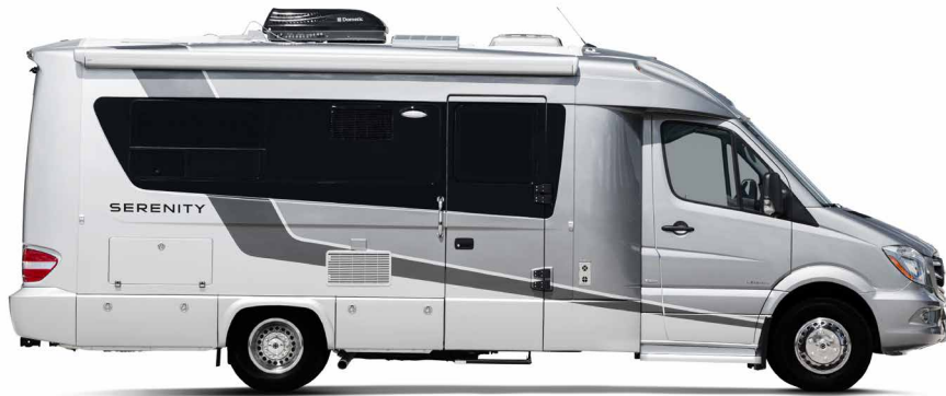
Silver Serenity Shown Above