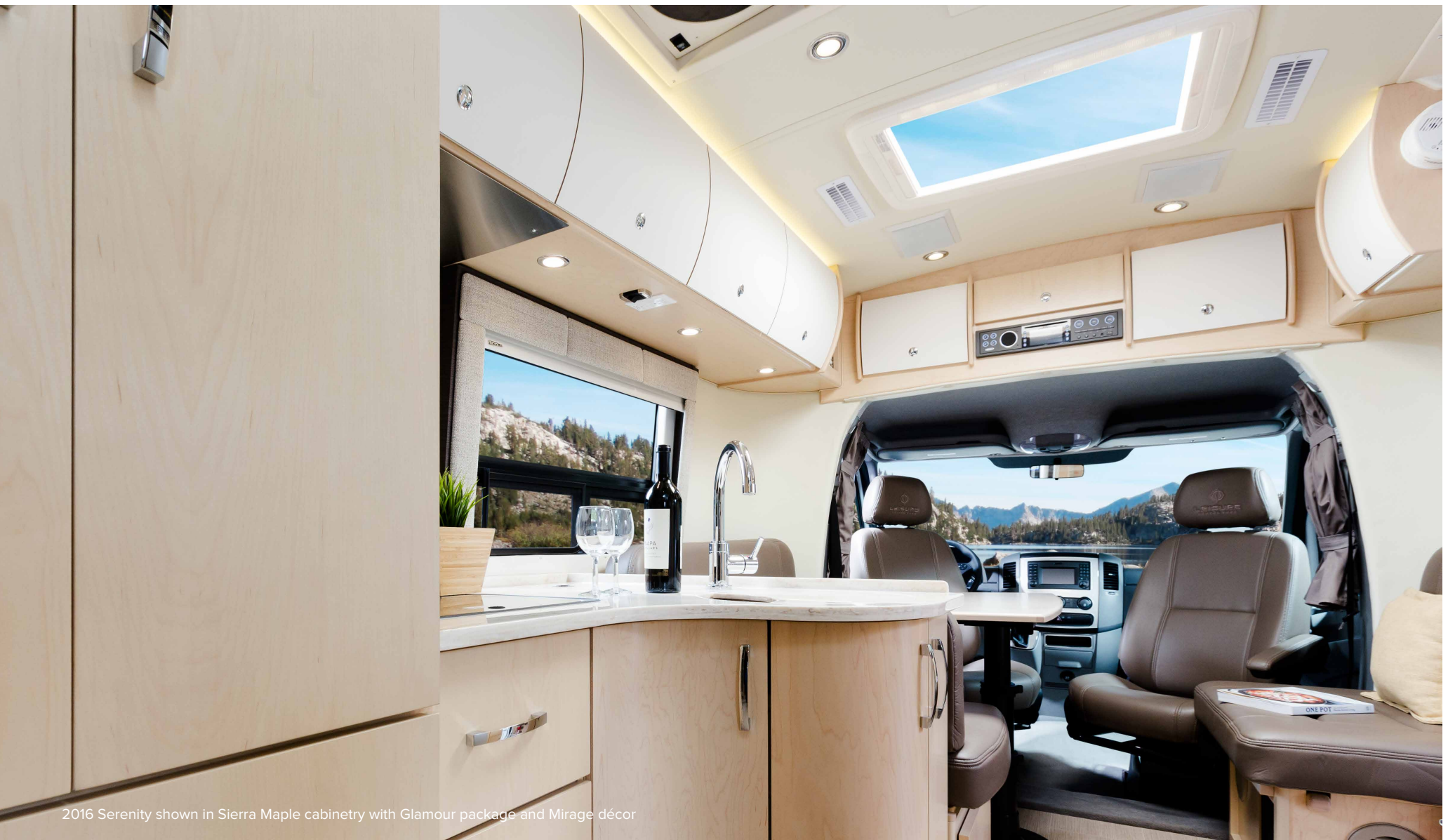
2016 Serenity shown in Sierra Maple cabinetry with Glamour package and Mirage décor