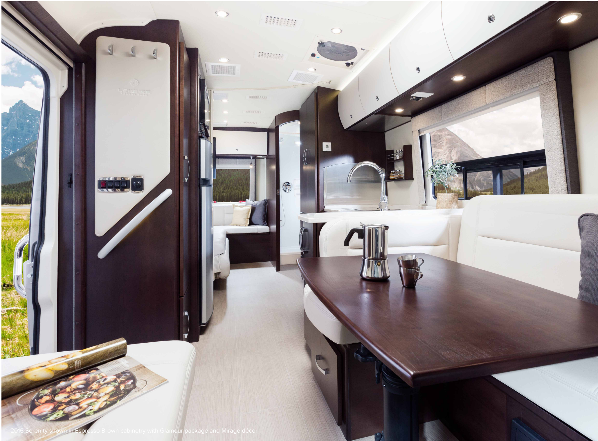
2016 Serenity shown in Espresso Brown cabinetry with Glamour package and Mirage décor