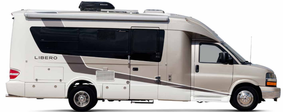
White Suede Libero Shown Above