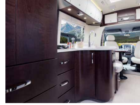
Espresso Brown Glamour Décor Package