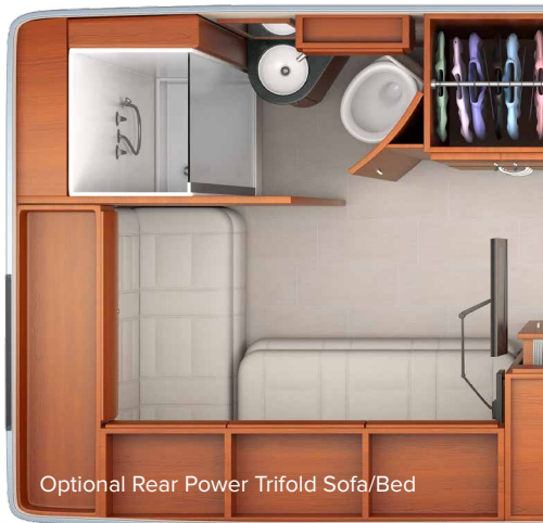
Optional Rear Power Trifold Sofa/Bed