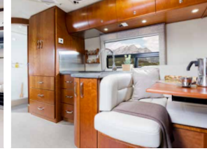
Chestnut Cherry Available w/ Glamour Package