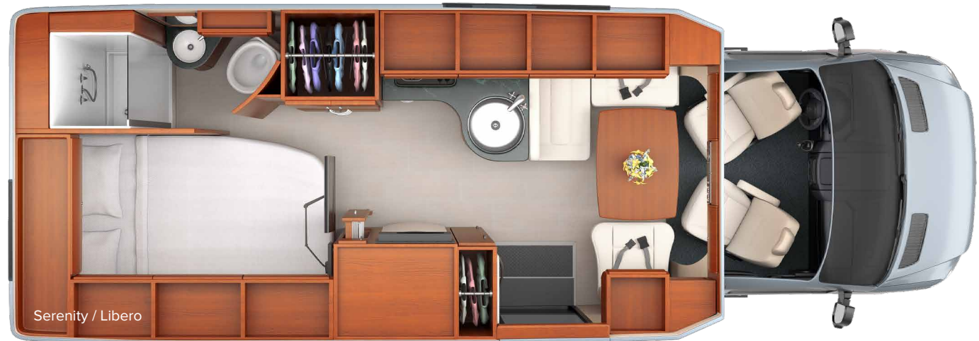
Serenity / Libero