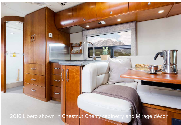
2016 Libero shown in Chestnut Cherry cabinetry and Mirage décor