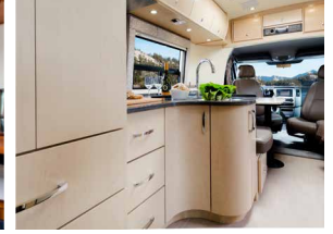
Sierra Maple Available w/ Glamour Package