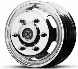
Alcoa Dura-Bright® Aluminum Wheels Optional - All 6 Wheels