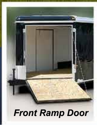
Front Ramp Door