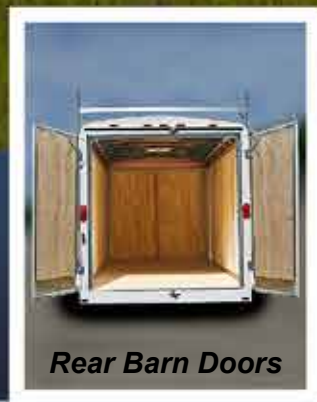
Rear Barn Doors