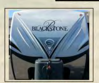
Silver HD Fiberglass Cap Black Armor Guard & Chrome Diamond Plate