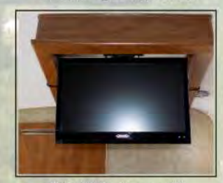
12V LED Bedroom TV (Standard)