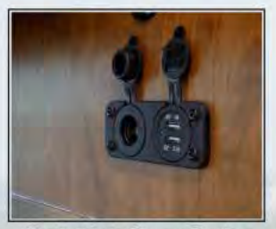
12volt Triple Charge Station (Charges iPads and Cell Phones)