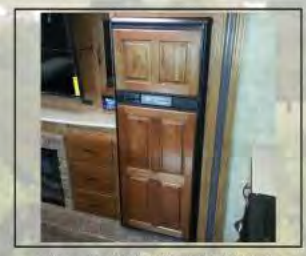
Norcold 9.5 CU FT Fridge w/ Cold Weather Kit