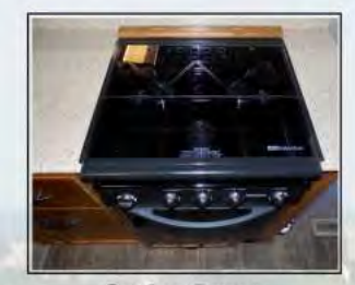
Sunken Range w/ Folding Glass Cover