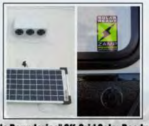
"No Boundaries" Off-Grid Solar Ready-Includes Door Side Portable Solar Port