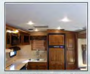
Vaulted 5" Radius Ceiling (5" of Additional Headroom)