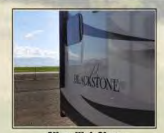
Silver High Gloss Lamilux 4000 Fiberglass