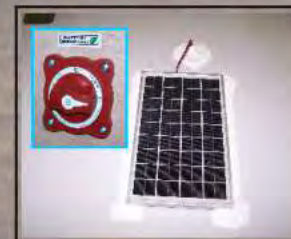
Eco Friendly Roof Mounted Battery Saving Solar Panel & Battery Disconnect