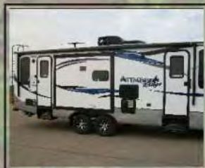
XL One Step Adjustable Electric Awning with Rain Dump Arm