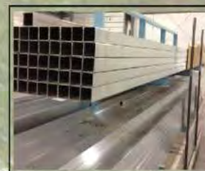
Rugged 2" Bonded Aluminum Frame