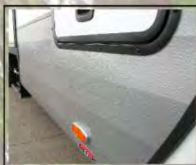
Rugged Silver Embossed Sidewall Skirts