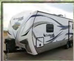
Lamilux 4000 HG Fiberglass Construction