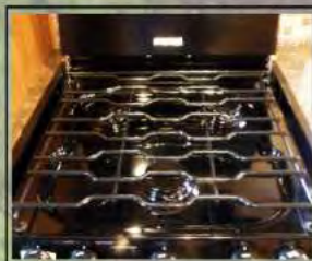
22" Sealed Burner Range