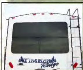
Radius Crowned Full Walk-On Roof w/Ladder (Increased Runoff)