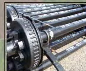
Heavy Duty 6 Lug 5200lb Axles with Off-Road Brake System