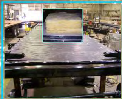
Fully Enclosed Front to Back Heated Insulated Underbelly Double Mountain Floor Insulation