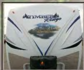
HD Fiberglass Front Cap with Armor Guard (with Diamond Plate Protection & LED Lights)