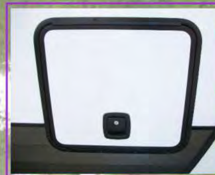
1" Thick Thermal Insulated Luggage Door Compartments