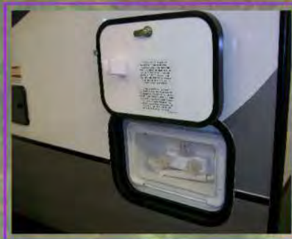
Exterior Shower Insulated by 1" Thick Thermal Insulated Luggage Door