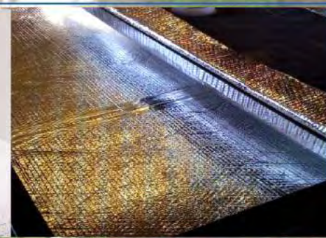
R-15 Astro-Foil Roof, Slide-Out Floor, Entire Underbelly, Additional Wrap Around Holding Tanks

**materials designs and specifications are subject to change without notice