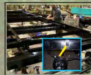
Custom Built Cambered Off-Road Chassis HD Shock Absorbers