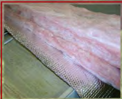
Triple Layered Four Seasons Roof Insulation