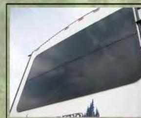
Ultra Sleek Frameless Window