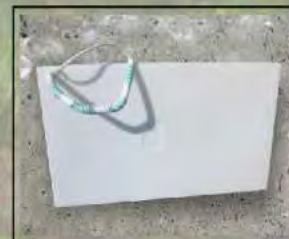
80 Gallon Fresh Water Capacity