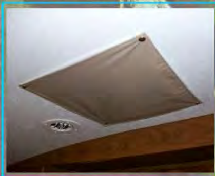
Insulated Snap Cover for Select Roof Vents (Model Specific)