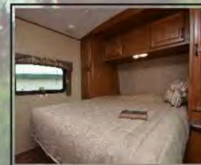
"Dream Soft" Pillow Top Mattress