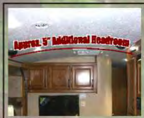
Vaulted Radius Ceiling Providing 5" of Additional Headroom