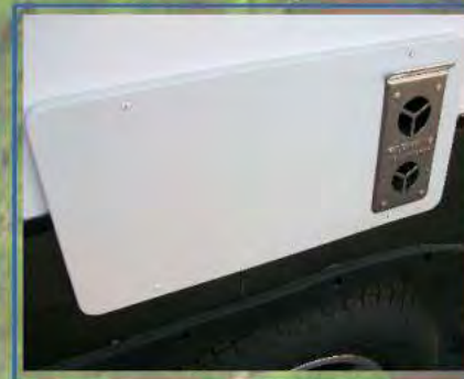
15% Larger XL Furnace (Extreme Camping Heat System)