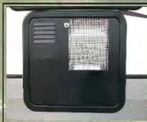
10 Gallon LP/110V Water Capacity