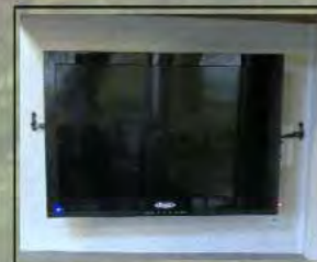
12 Volt 26" - 32" LED HD TV With Home Theatre Sound System