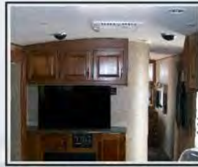
Vaulted 5" Radius Ceiling w/ Crown Molding