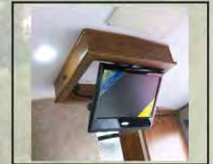
Bedroom TV Standard