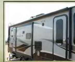
Weather Guard Awning Shield