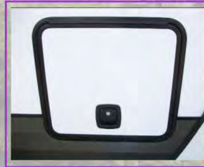
1" Thick Thermal Insulated Luggage Door Compartments