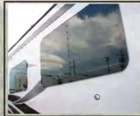
Thermal Pane "Mountain Extreme" Sleek Frameless Tinted Windows (Standard)