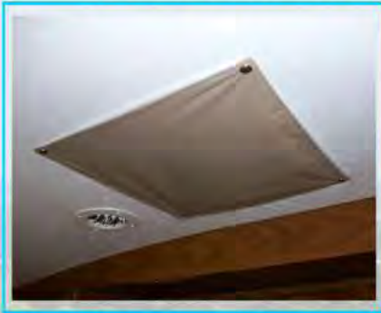
Insulated Snap Cover for Select Roof Vents (Model Specific)