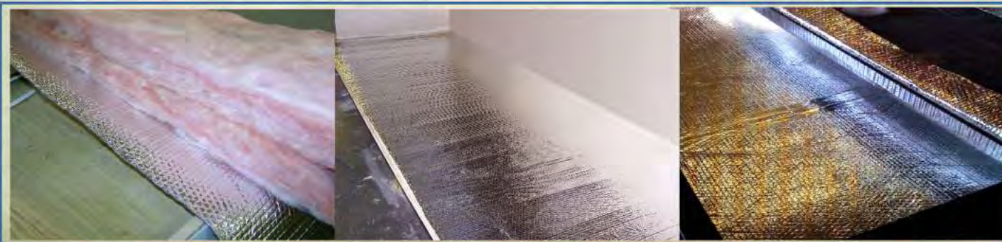
R-15 Astro-Foil Roof, Slide-Out Floor, Entire Underbelly, Additional Wrap Around Holding Tanks

"materials designs and specifications are subject to change without notice"