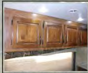
Mountain Chestnut Wood w/ Black Glazed Cabinetry