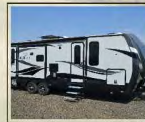
Silver HG Lamilux 4000 Fiberglass