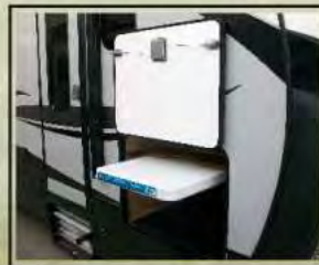
Portable Outdoor Table