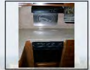
Sunken Range w/ Cover