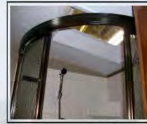
Residential Radius Designed Shower