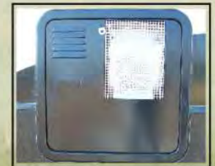
10 Gallon LP/110V Water Heater