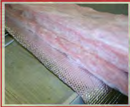
Triple Layered Four Seasons Roof Insulation