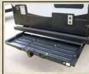
All New Bumper Storage Rack (Standard)