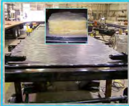
Fully Enclosed Front to Back Heated Insulated Underbelly Double Mountain Floor Insulation