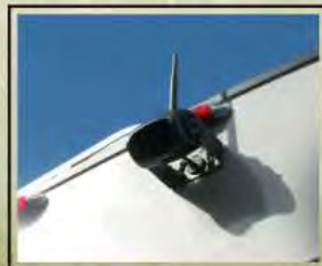
Back Up Camera (Standard)