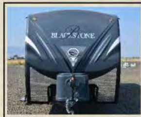
Charcoal HD Fiberglass Cap w/ Black Armor Guard & Chrome Diamond Plate