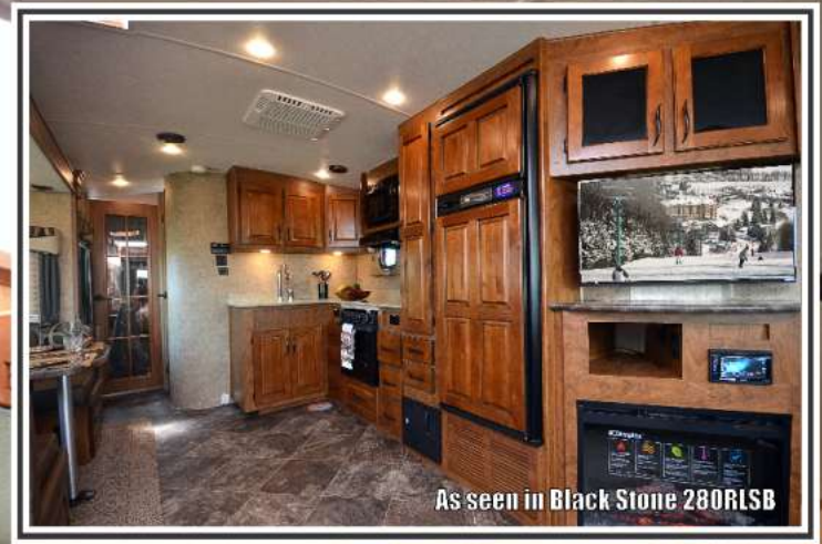
As seen in Black Stone 280RLSB