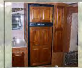
Norcold 9.5 CU FT Sleek Design Fridge