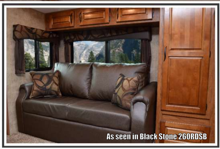
As seen in Black Stone 260RDSB