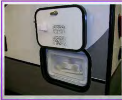
Exterior Shower Insulated by 1" Thick Thermal Insulated Luggage Door