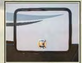
"Mountain Sized" 50% Larger Exterior Luggage Door Opening