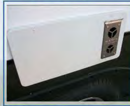
15% Larger XL Furnace (Extreme Camping Heat System)