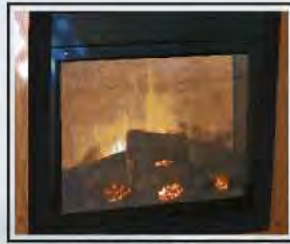
Living Room Fireplace