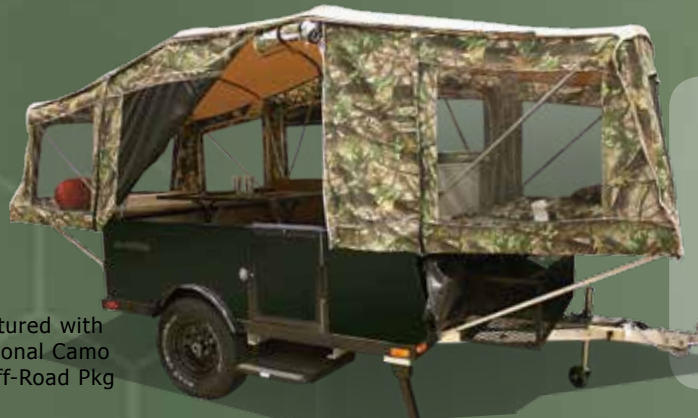
Pictured with optional Camo & Off-Road Pkg