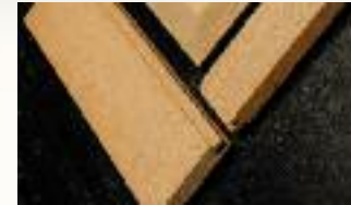
Mortise and tenon construction

Here's where old world craftsmanship meets cutting-edge technology. Dynamax builds with solid cherry hardwoods to produce the same exceptional cabinet construction found in your home.