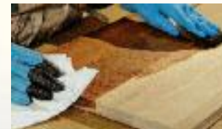
Hand rubbed finishes optimize grain definition