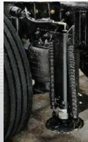
Hydraulic push-button self leveling system and rear air ride suspension