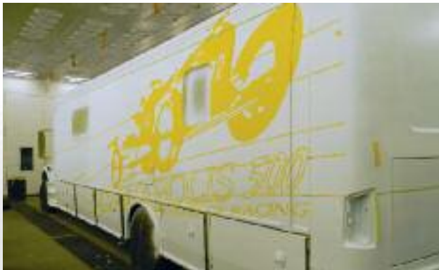
A digitally-plotted spray mask is carefully applied.

Swirls give you vertigo? By doing our paint in-house we're able to accommodate solid color paint requests. This paint is applied with the same detail that we use on our own local artist designed themes.