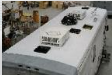
Radiused, laminated one-piece fiberglass roof is standard on all models.