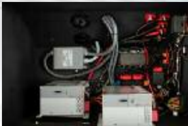
Deutsch heavy-duty, water-tight, bulk connectors with two 3,000 watt power inverters shown.