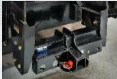
20,000 lb. Standard Hitch