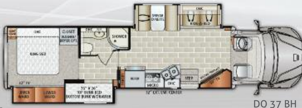
DQ 37 BH