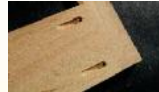
Pocket screws for structural integrity