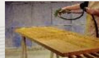
Clear-coated solid hardwood doors provide additional protection and luster