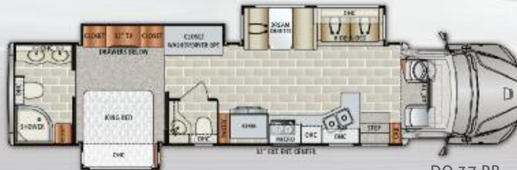
DQ 37 RB