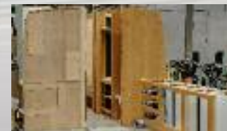
Dividing walls and cabinets are reinforced for added strength