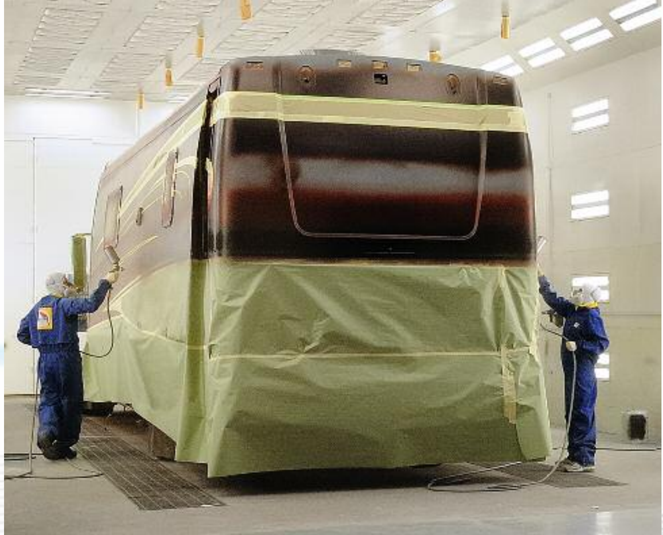
Dynamax has three on-site 25' x 60' paint booths. This means we have maximum control of quality. By painting parts and slide-outs before they are installed, we eliminate overspray on slide seals and interior components.