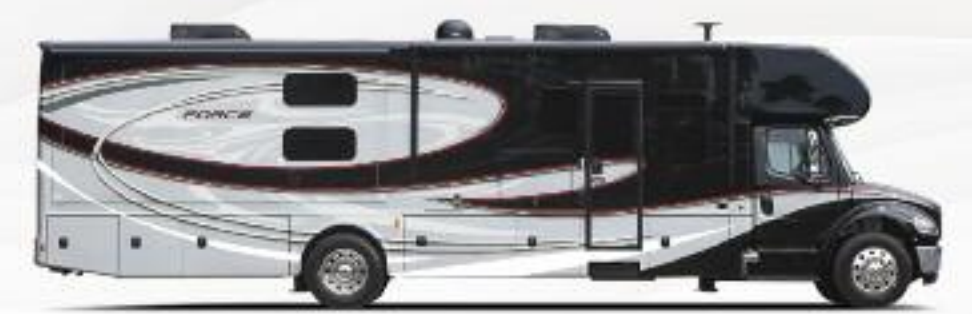
Billet (Force HD – Black Mirage*)