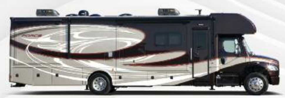
Driftwood (Force HD – Desert Mirage*)