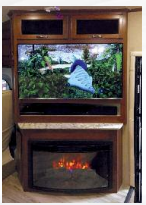
Optional 50" TV with Fireplace (37BH Only)