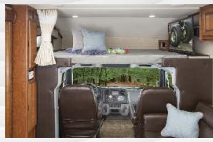
Versatile sleeping and entertainment features include this overcab bunk with a 39" LED TV on a Powered Swing Arm.