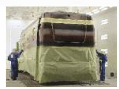
Dynamax has three on-site 25' x 60' downdraft paint booths. This means we have maximum control of quality. By painting parts and slide-outs before they are installed, we eliminate overspray on slide seals and interior components.