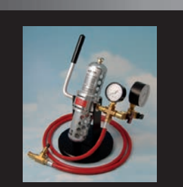
Seek-A-Leak Pressure Test