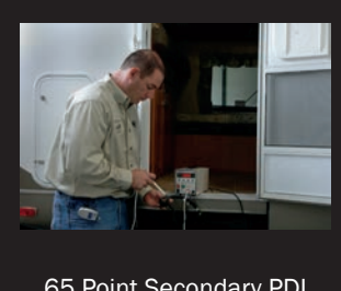
65 Point Secondary PDI