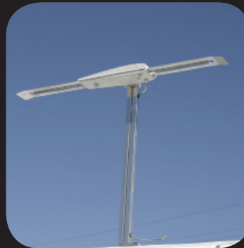
DIGITAL HD TV ANTENNA