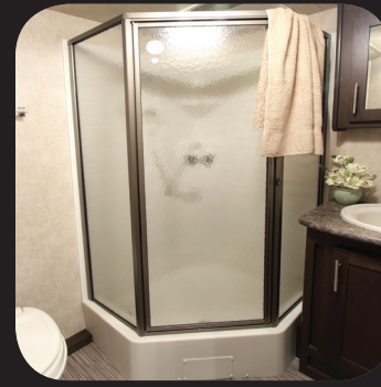
OPT GLASS SHOWER (PER FP)