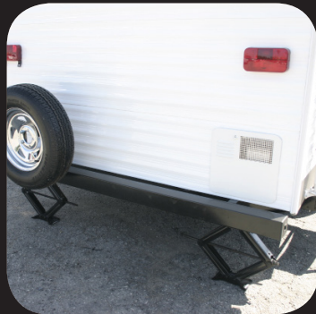
4 CORNER STABILIZER JACKS + MATCHING SPARE