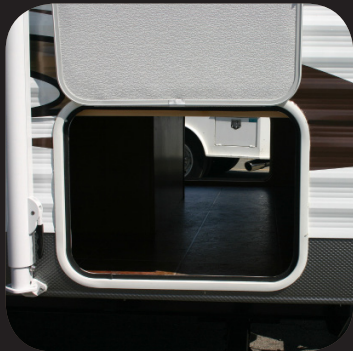
FULL PASS THROUGH STORAGE

HD LED TV 30# LP Bottles Alumina Wall Fiberglass Exterior BBQ Hook Up Black Tank Flush Chrome Wheels w/ Matching Spare Spare Tire w/ Carrier Ducted Air Conditioning 15k BTU Air Conditioner w/ Quick Cool Power Awning w/ Adjustable Legs Glass Shower Enclosure (per FP) Night Shades Outside Shower Power Tongue Jack Roof Ladder Skylight Over Tub Stainless Steel Package Storage Plus Door (T2550 Only) Stabilizer Jacks Deluxe Swivel Chairs (T2460) 160W Solar Kit Arctic Package -Insulated & Enclosed Tanks -12v Heat Strips -R7 Fiberglass Insulation Throughout -R-38 Radiant Foil (Roof and Floor) Tankless Water Heater