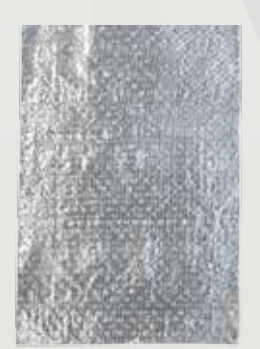
Additional R38 Radiant Technology, Insulation Standard