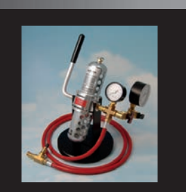
Seek-A-Leak Pressure Test