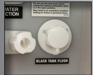
The black tank flush makes emptying the tank a clean, easy process!