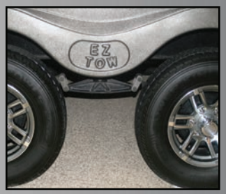
Tracer offers E-Z Tow on most models - another Prime Time innovation designed to minimize "bouncing" while towing.