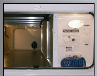
The Universal Docking Station provides easy setup for your camping experience and protects hookups from the elements!