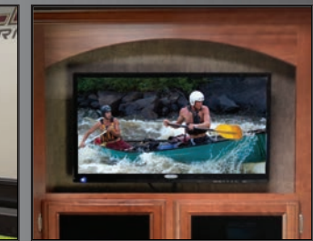
All Tracers have LED TV's to provide exceptional viewing