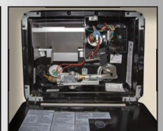
Tracer's high efficiency water heater allows users up to 18 gallons of hot water per hour!