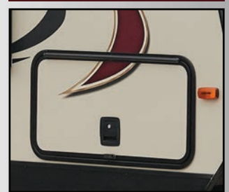
You don't have to buy a diesel motor home to get the security and convenience of bus style slam latch baggage doors.