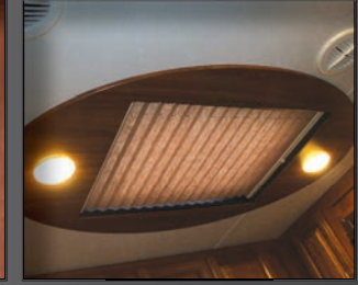
The extra-large skylight adds great natural lighting to the unit's