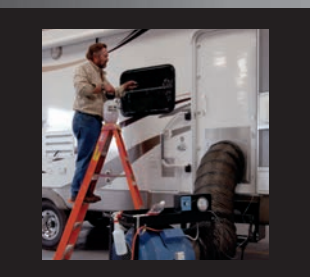
Seal Tech Air Pressure Test

Prime Time Manufacturing is proud to be recognized as an industry leader in value. reliability, and overall quality by the Recreational Vehicle Dealers Association. This was accomplished by committing ourselves to "A Higher Standard" in design, construction, testing, and customer service. Check us out — we know you'll be impressed!