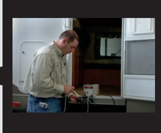
65 Point Secondary PDI