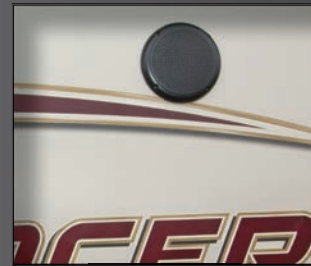
Your entertainment options are multiplied with Tracer's exterior speakers.