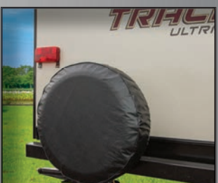
Tracer's spare tire affords piece of mind on board your home away from home!