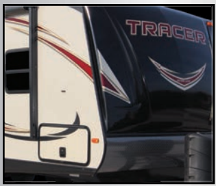
Tracer provides diamond plate Protection to protect your investment.