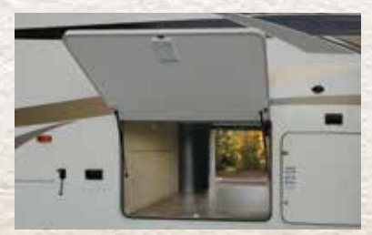
Cedar Creek's original design "Z-frame" chassis. This frame gives our customers over 100 cu. ft. of storage space, turning their front storage compartment into a front storage shed.