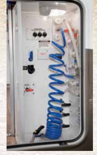
Docking Station includes outside shower, black tank flush, water bypass, 12V battery disconnect, selector switches, dump valves, water tank and city fills for centralized convenience.