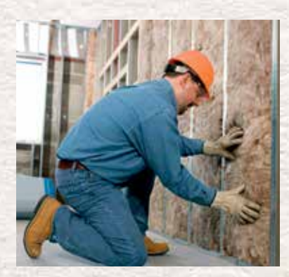
Residential Glasswool Insulation, designed by nature.