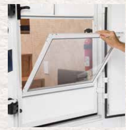
Removable "Soft Top" Vinyl Storm Doors allow light and visibility without losing cooling or heating.