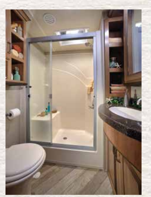
Cedar Creek's luxurious bathroom includes a spacious 48" one-piece fiberglass residential shower with a large seat and triple sliding glass doors, an 18" tall porcelain toilet with circular flush and a Fantasic Fan.