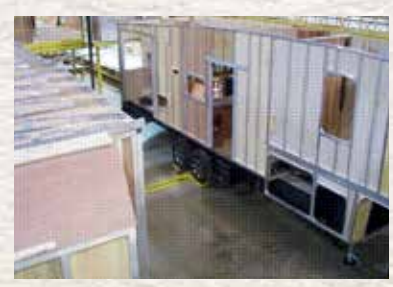
Cedar Creek's famous residential All-aluminum Super-structure (Roof, sidewalls, and floor) on 16" centers or less.