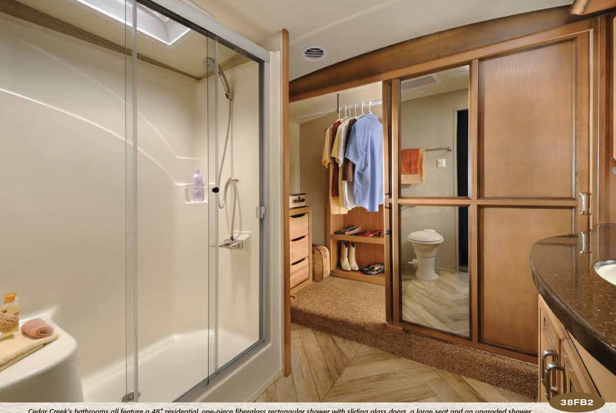
Cedar Creek's bathrooms all feature a 48" residential, one-piece fiberglass rectangular shower with sliding glass doors, a large seat and an upgraded shower head. An 18" circular flow porcelain toilet and linen cabinet complete this spacious bathroom. This walk-in closet makes the most of every inch, with a place for everything. Each closet is washer/dryer prepped, features 92" of hanging space, a three drawer storage box, and plenty of shelving.