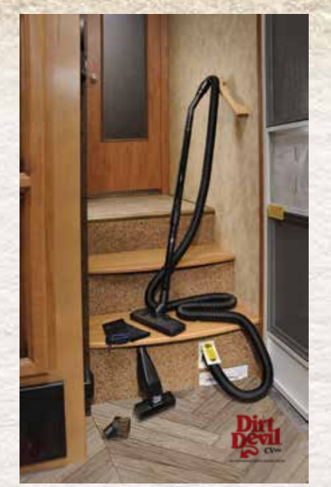
Dirt Devil® CV950 central vacuum cleaning system with VacPan™ automatic dustpan at entry door.