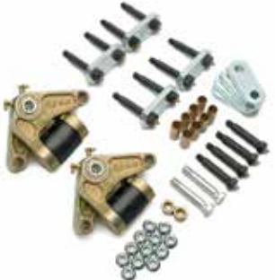
Dexter E-Z Flex® Suspension Standard