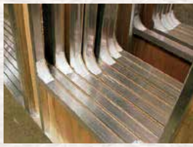
Aluminum window frames.