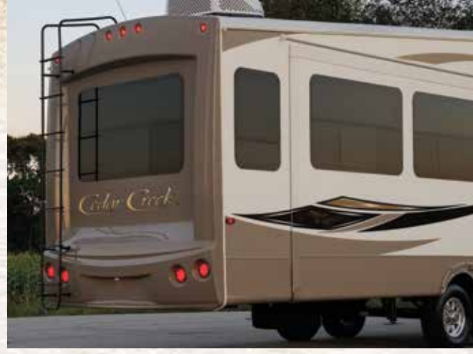
True Nobel Classic fiberglass gelcoat exteriors and end walls. Truly the best of the best in fiberglass. Accept no imitations.

Remote control for slides, hydraulic jacks, awning and security lights Black metal wrapped A&E awnings with LED night light strip Radiant Shield thermo-foil R-38 value R-38 ♦ Heating pads on all tanks