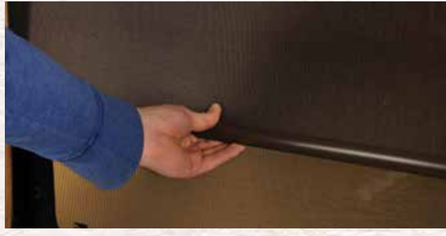
These day shades with blackout roller shades offer the best of both worlds. They're actually two shades in one – a night fabric lowers completely for privacy, or can be retracted to the top to reveal a full length day shade. Both day and night shades can be set in any position and are designed with speed and length controls for privacy or a scenic view.