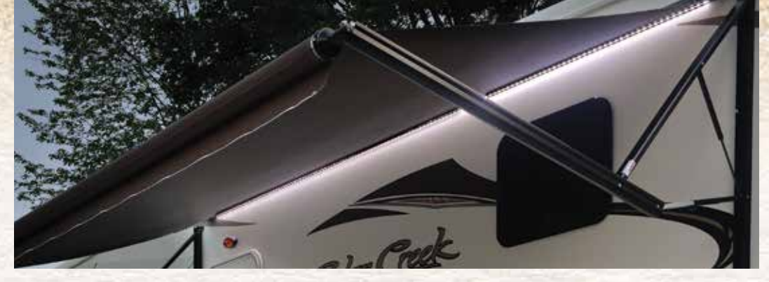
A&E metal wrapped awning with LED night light strip.