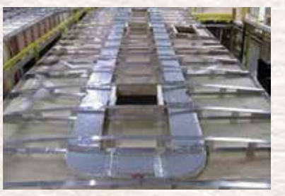
High-Performance Quiet Zone™ Ducted Air System with a 15,000-BTU HP air conditioner, a residential-style return air duct system and Comfort Control Center creates a dynamic combination for powerful results. It's the most efficient AC system in existence with both the industry's highest-performance AC and the industry's lowest power draw, with second Bedroom air conditioner too!