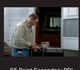
65 Point Secondary PDI