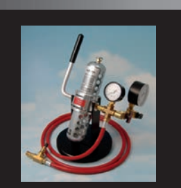
Seek-A-Leak Pressure Test