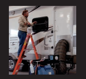
Seal Tech Air Pressure Test

Prime Time Manufacturing is proud to be recognized as an industry leader in value, reliability, and overall quality by the Recreational Vehicle Dealers Association, This was accomplished by committing ourselves to "A Higher Standard" in design, construction, testing, and customer service. Check us out — we know you'll be impressed!